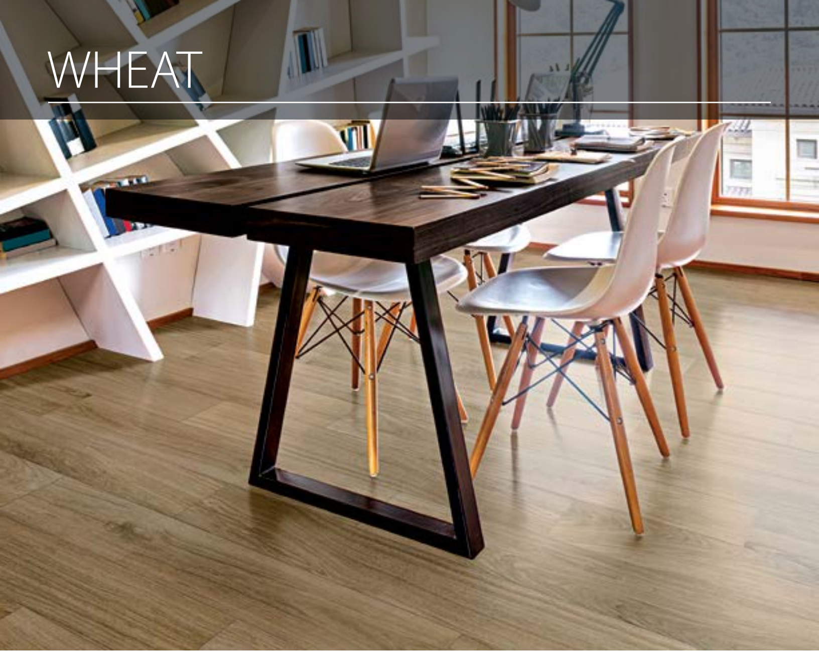
above: DIS10 8x48 Wheat