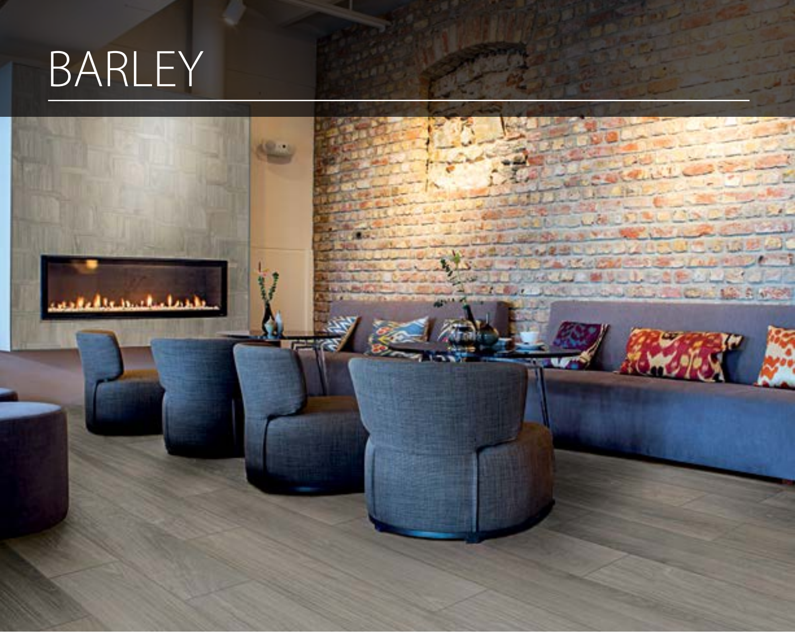
above: DIS20 8x48 Barley & DIS20M10x13TWI Twist Barley Mosaic