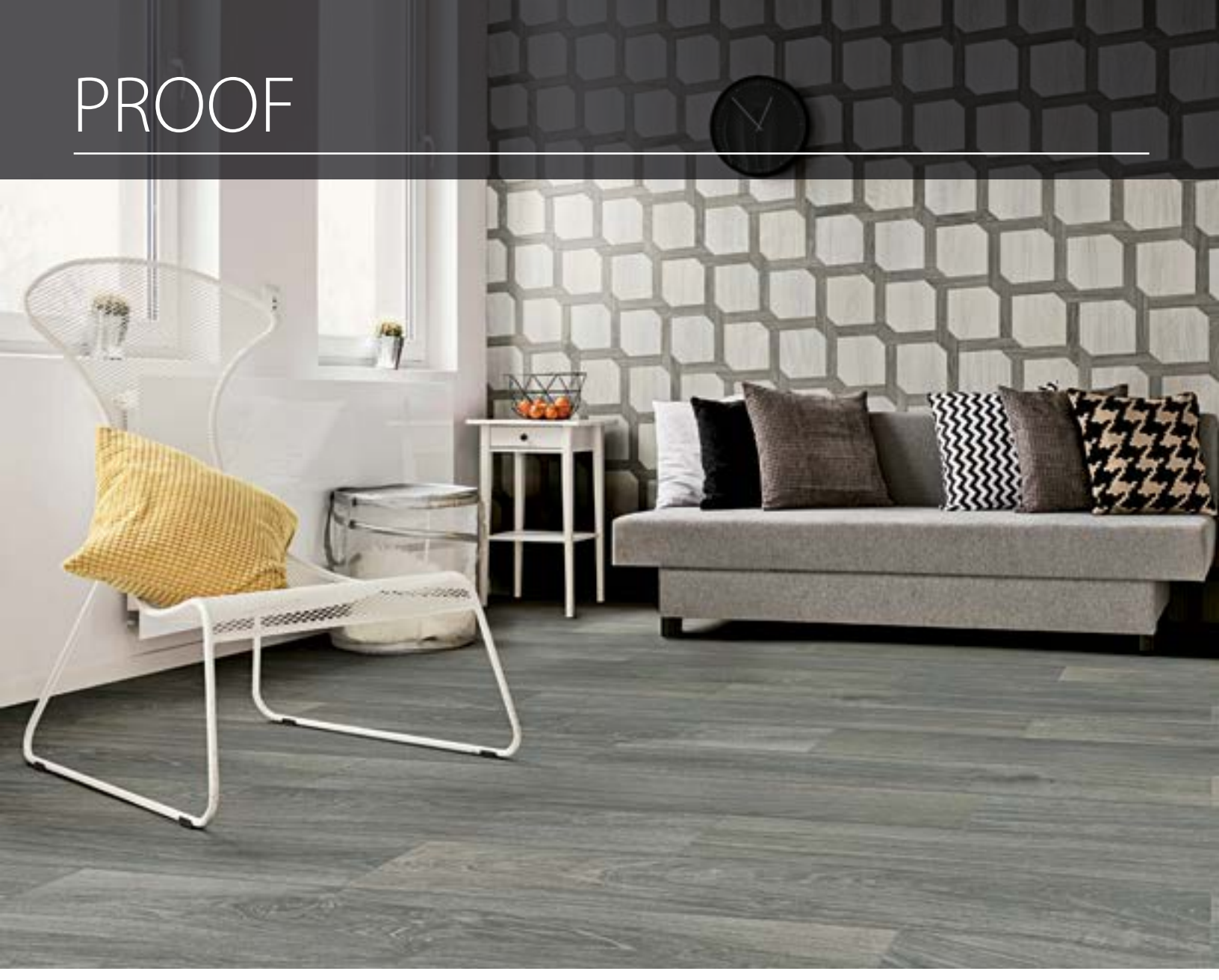
above: DIS40 8x48 Proof & DIS75M10x13TWI Twist Cool Mosaic