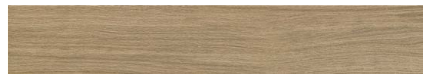
DIS10 8x48 Wheat