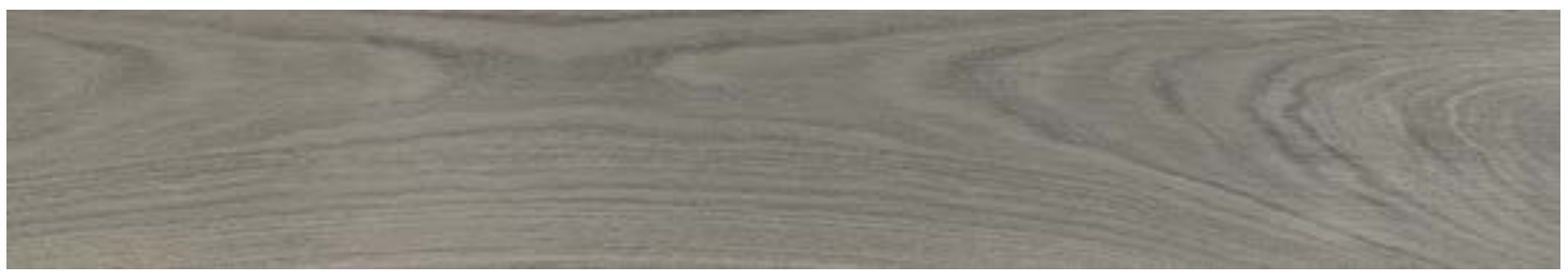
DIS20 8x48 Barley