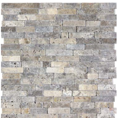
TM586/RSP5/8 Tumbled Random Stack Mosaic