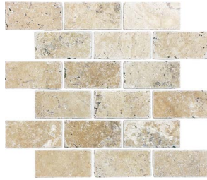
P0444A/2x4 Tumbled Brick Mosaic