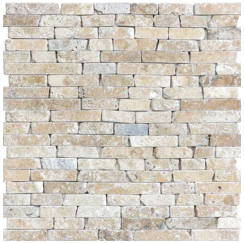
TM546/RSP5/8 Tumbled Random Stack Mosaic