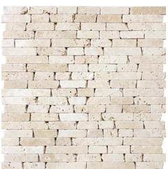
TM526/RSP5/8 Tumbled Random Stack Mosaic