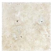
TM520 8x8 TM521 8x16 (not shown) TM522 16x16 (not shown) TM523 16x24 (not shown) Chiseled Edge