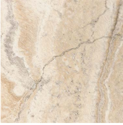
P0444 12x12 P0444A 18x18 (not shown) Filled & Honed