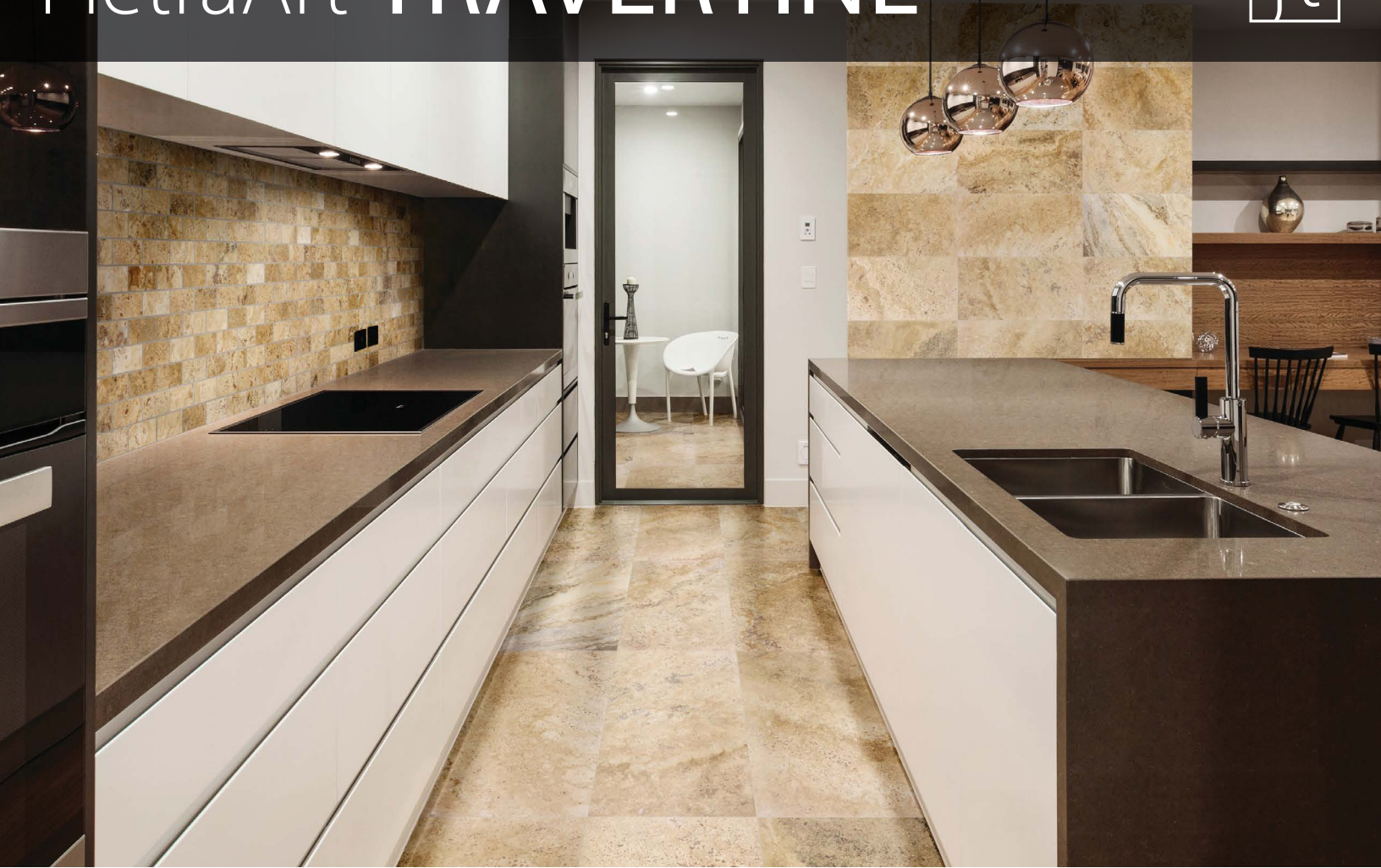
above: P0444 3x6 Picasso Tumbled

note: Inspect all tiles before installation. Natural stone products inherently lack uniformity and are subject to variation in color, shade, finish, etc. It is recommended to blend tiles from different boxes when installing. Natural stones may be characterized by dry seams and pits that are often filled. The filling can work its way out and it may be necessary to refill these voids as part of a normal maintenance procedure. All natural stone products should be sealed with a penetrating sealer.