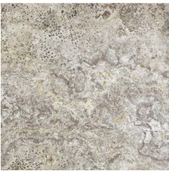
P010A 12x12 P010A 18x18 (not shown) Filled & Honed