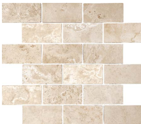
P003A/2x4 Tumbled Brick Mosaic