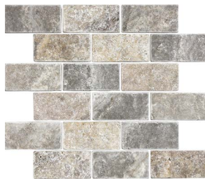
P010A/2x4 Tumbled Brick Mosaic