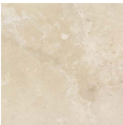
P003 12x12 P003A 18x18 (not shown) Filled & Honed