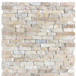
TM546/RSP5/8 Tumbled Random Stack Mosaic