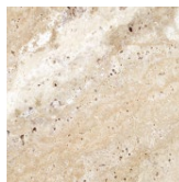
TM540 8x8 TM541 8x16 (not shown) TM542 16x16 (not shown) TM543 16x24 (not shown) Chiseled Edge