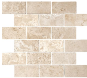
P003A/2x4 Tumbled Brick Mosaic