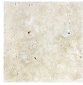
TM520 8x8 TM521 8x16 (not shown) TM522 16x16 (not shown) TM523 16x24 (not shown) Chiseled Edge