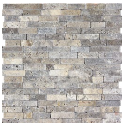
TM586/RSP5/8 Tumbled Random Stack Mosaic