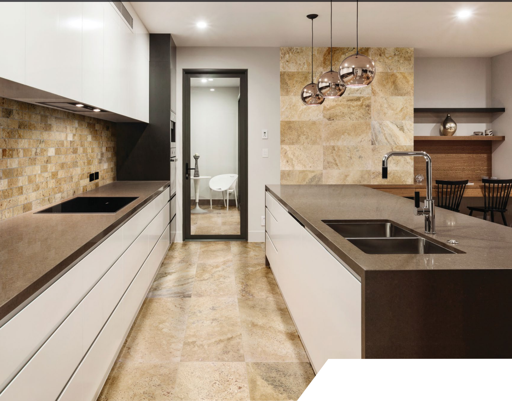
above: P0444 3x6 Picasso Tumbled

note: Inspect all tiles before installation. Natural stone products inherently lack uniformity and are subject to variation in color, shade, finish, etc. It is recommended to blend tiles from different boxes when installing. Natural stones may be characterized by dry seams and pits that are often filled. The filling can work its way out and it may be necessary to refill these voids as part of a normal maintenance procedure. All natural stone products should be sealed with a penetrating sealer.