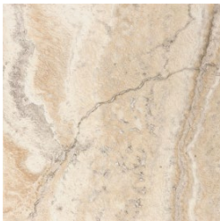
P0444 12x12 P0444A 18x18 (not shown) Filled & Honed