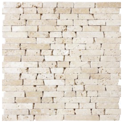
TM526/RSP5/8 Tumbled Random Stack Mosaic