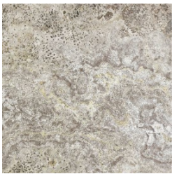
P010A 12x12 P010A 18x18 (not shown) Filled & Honed