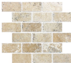
P0444A/2x4 Tumbled Brick Mosaic