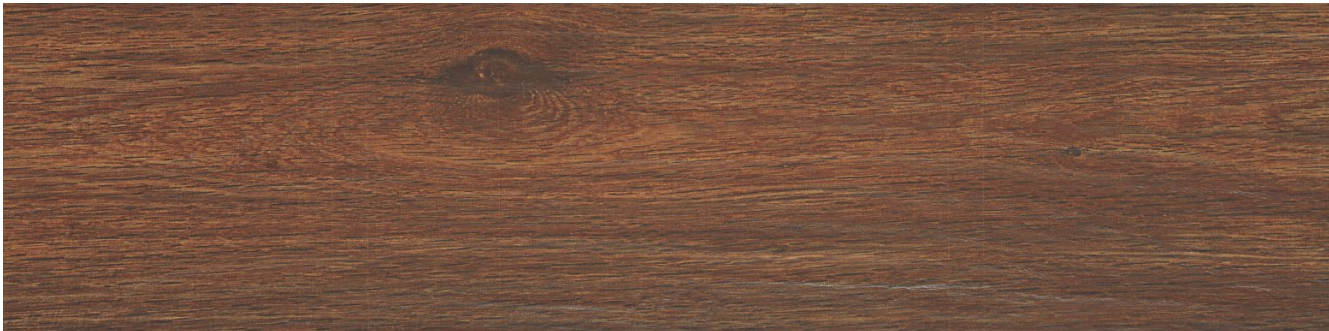
25585 8x36 Walnut