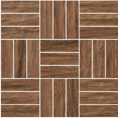
25585/M12REC Walnut Parquet Mosaic