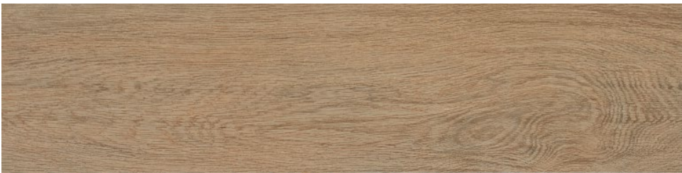
25525 6x24 Oak