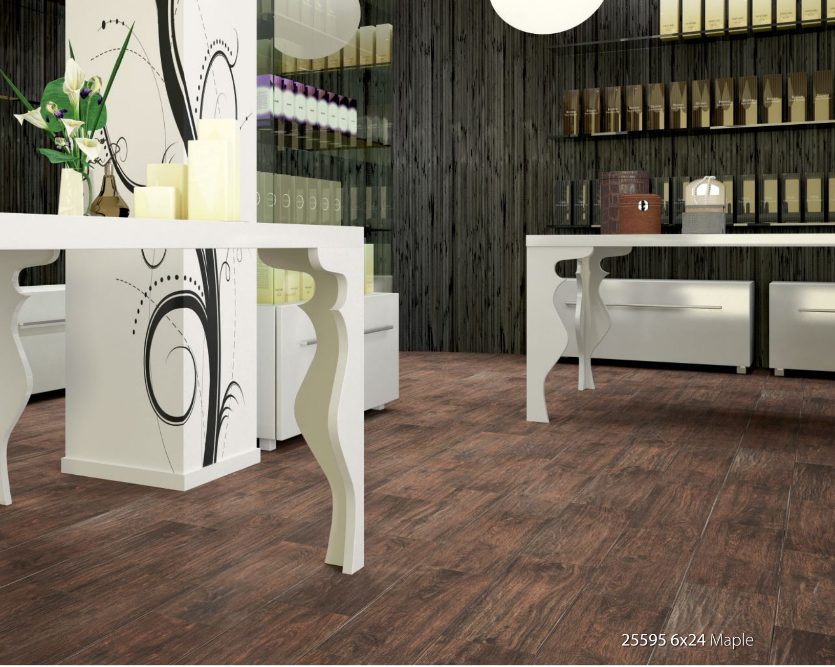
25595 6x24 Maple