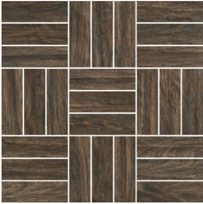
25555/M12REC Olive Parquet Mosaic