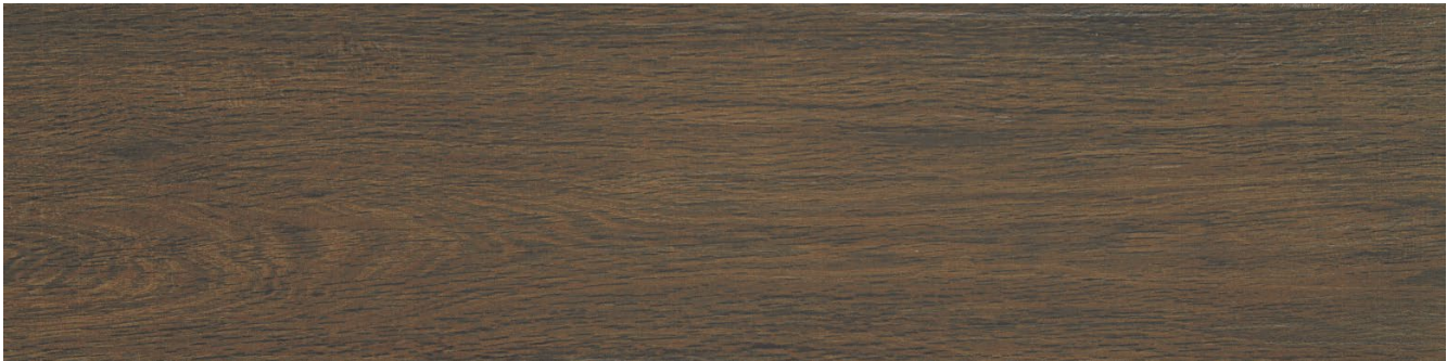
25555 8x36 Olive