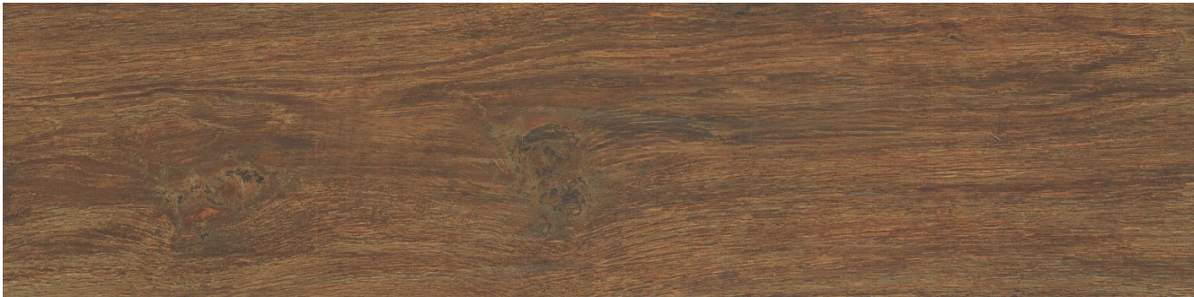
25535 8x36 Hickory