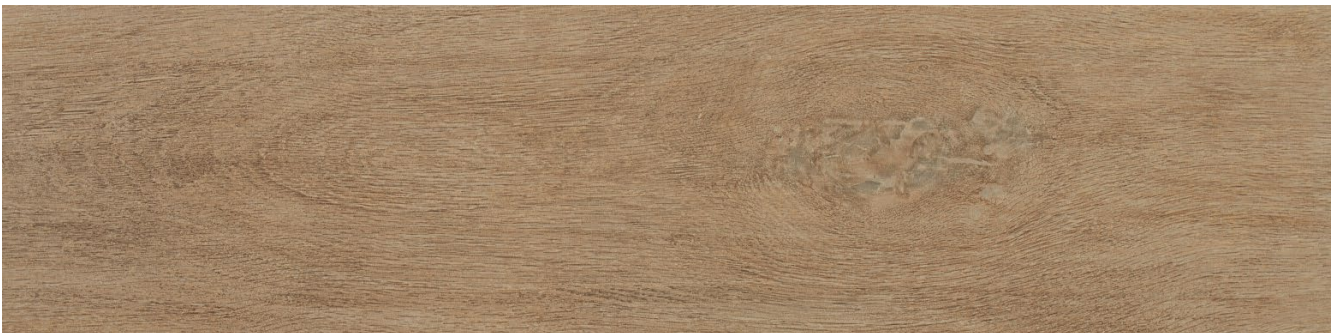
25525 8x36 Oak