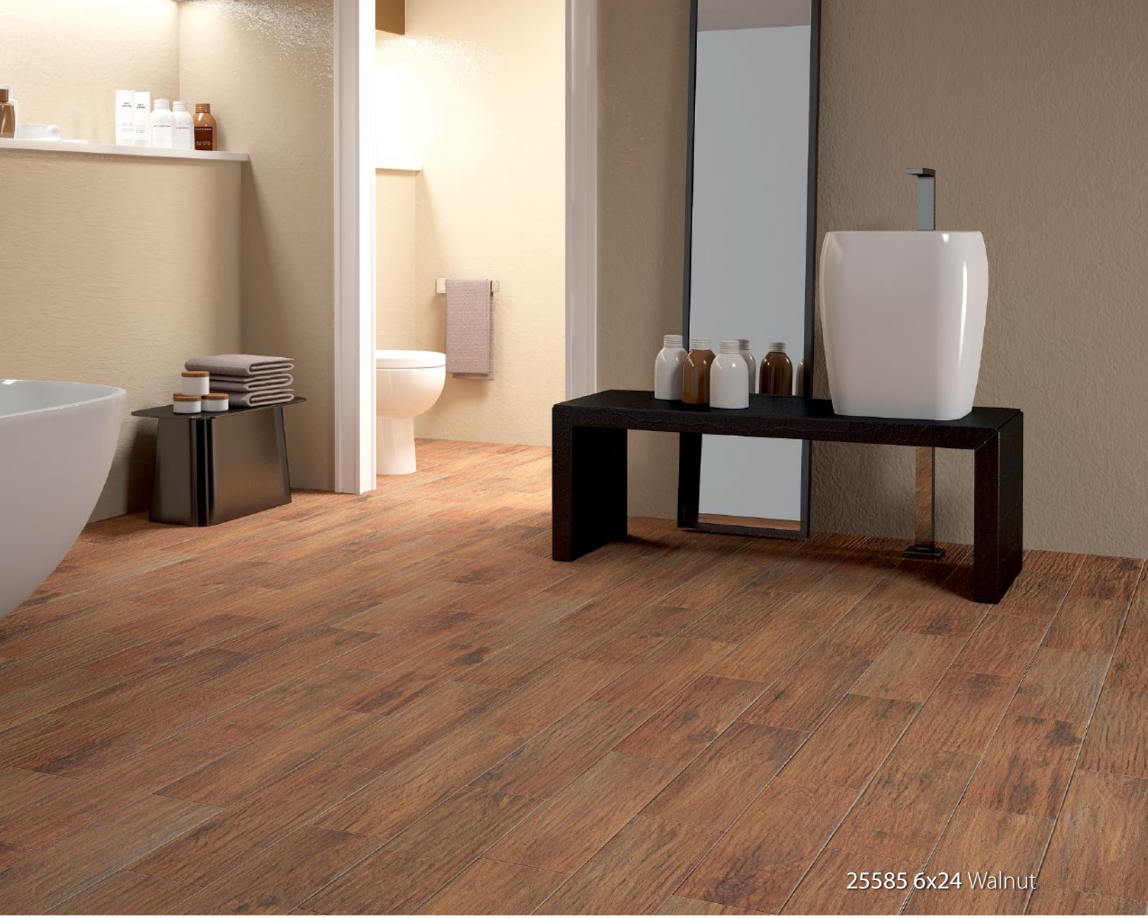
25585 6x24 Walnut