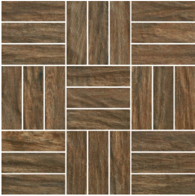
25535/M12REC Hickory Parquet Mosaic