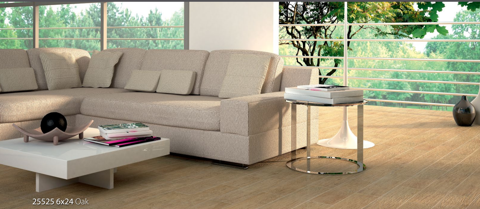
25525 6x24 Oak