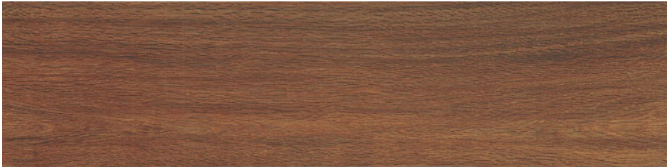
25585 6x24 Walnut