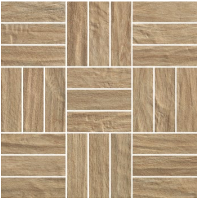
25525/M12REC Oak Parquet Mosaic