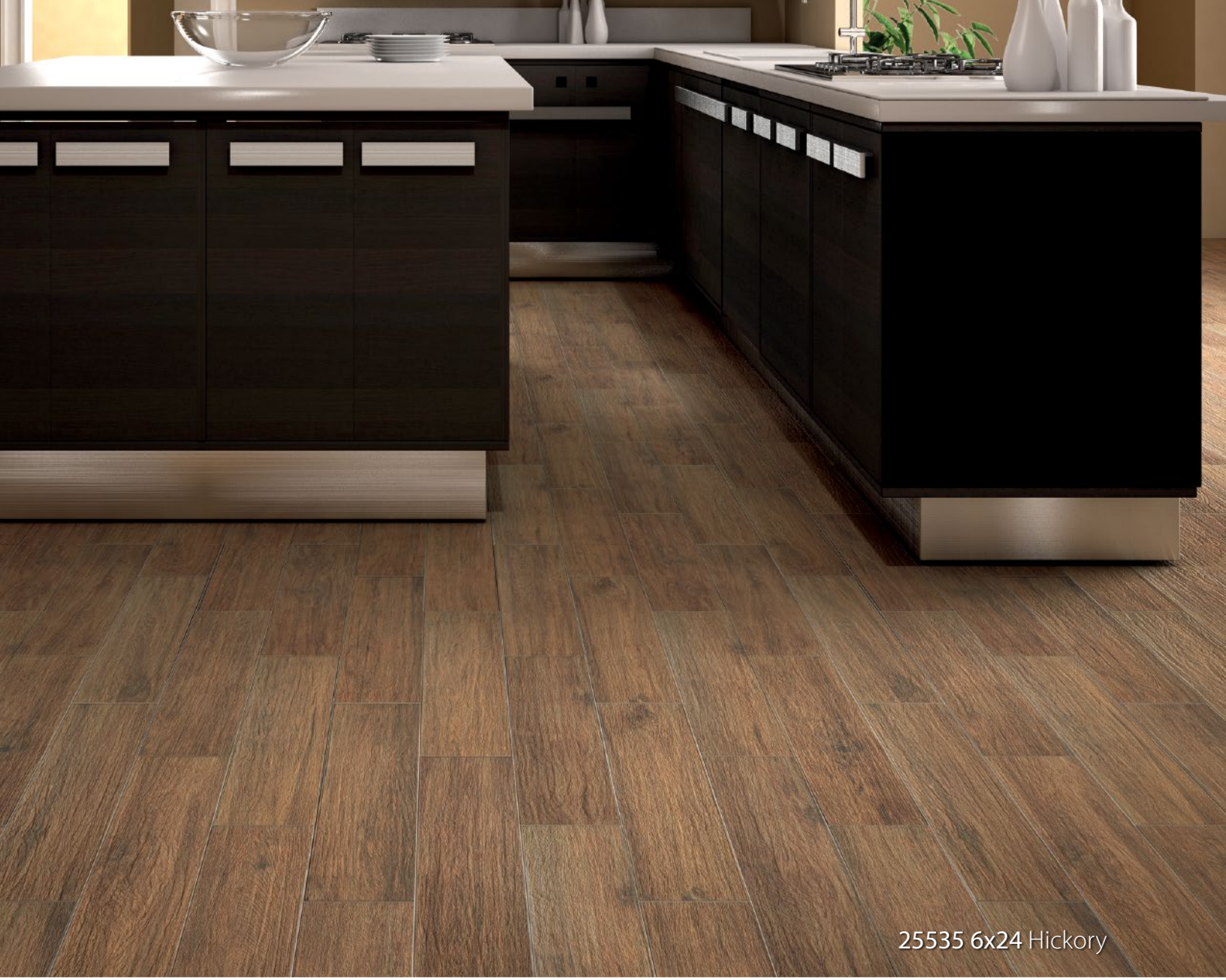
25535 6x24 Hickory