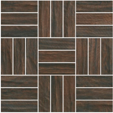
25595/M12REC Maple Parquet Mosaic