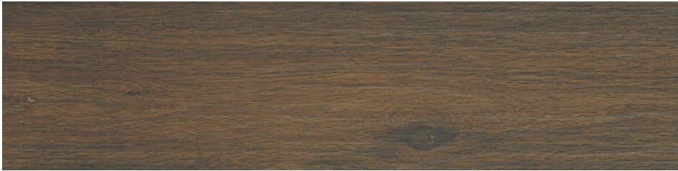
25555 6x24 Olive