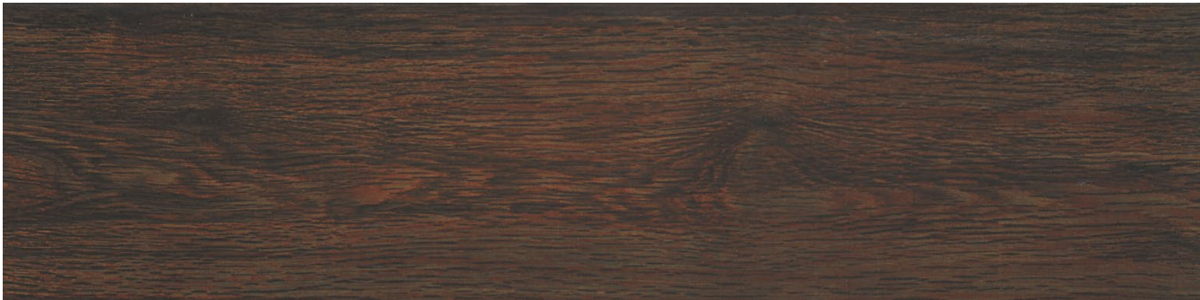
25595 8x36 Maple