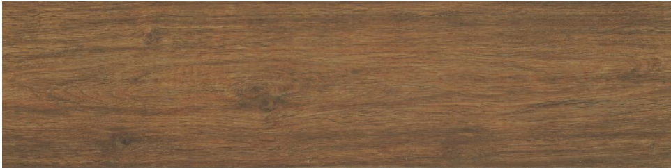
25535 6x24 Hickory