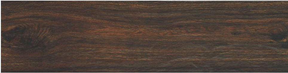
25595 6x24 Maple