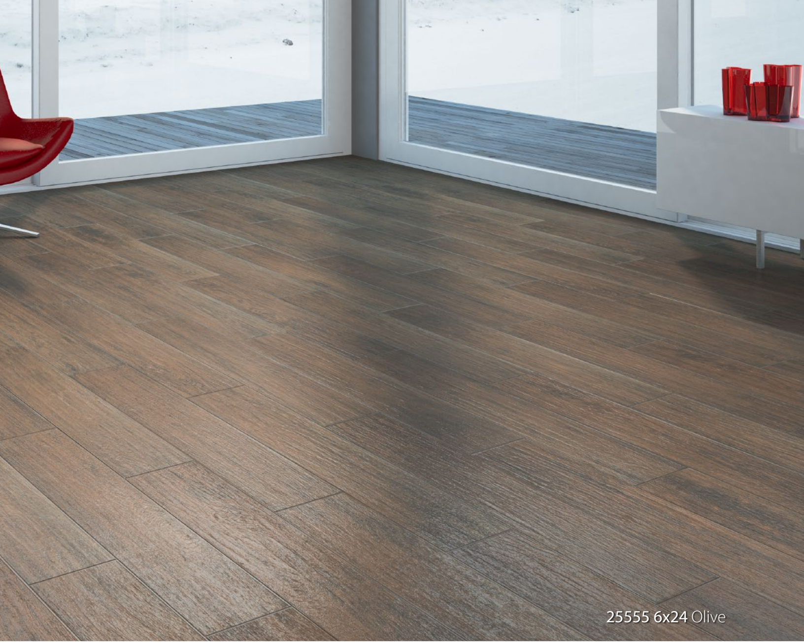
25555 6x24 Olive