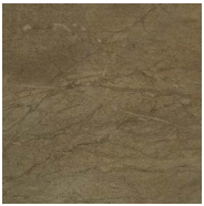
27224 6x6 Rye