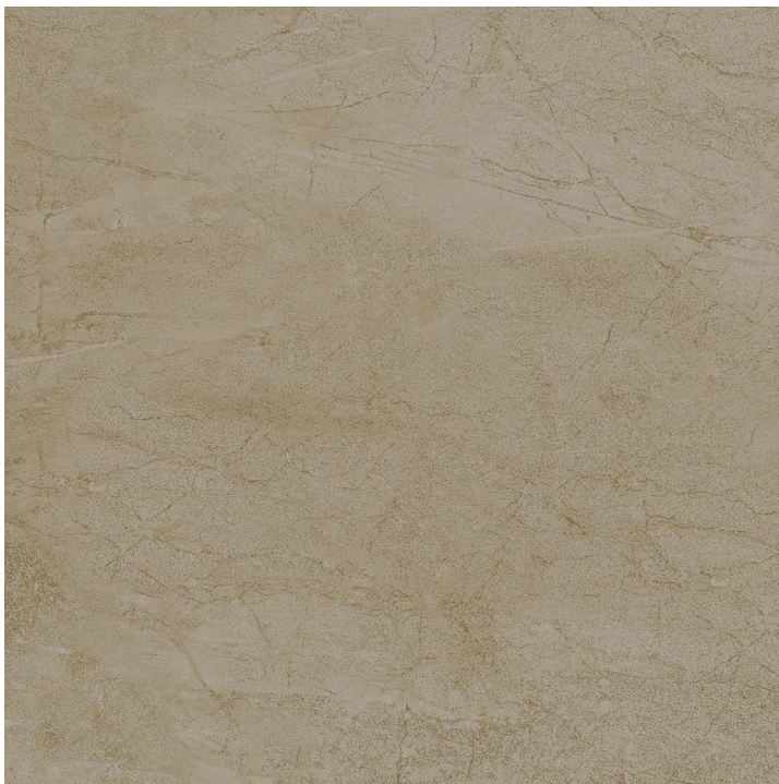
27230 24x24 Wheat