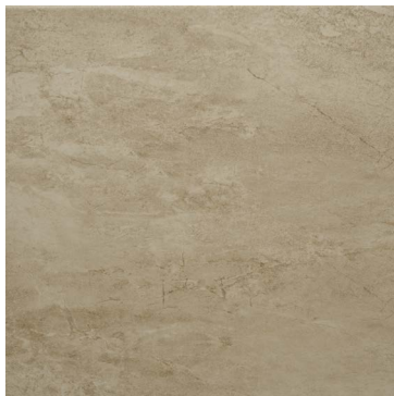
27230 12x12 Wheat