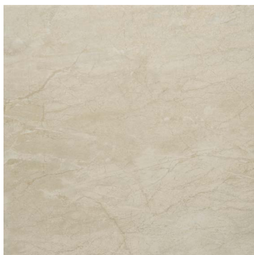
27202 12x12 Biscuit