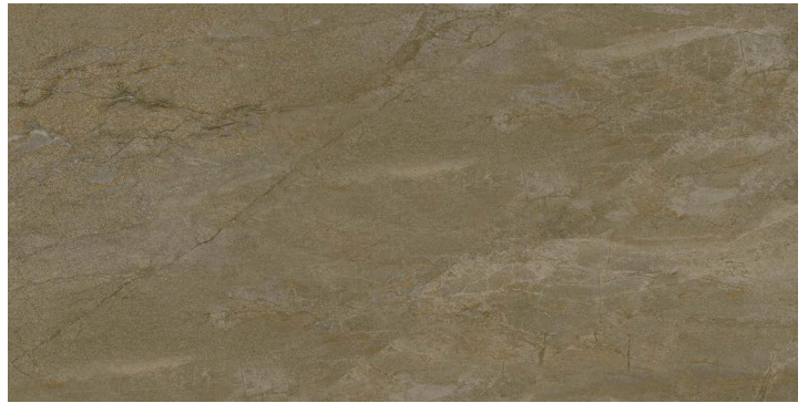
27224 12x24 Rye