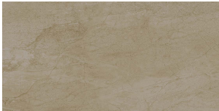
27230 12x24 Wheat