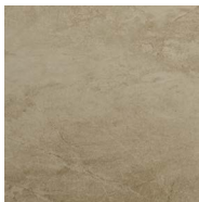
27230 6x6 Wheat