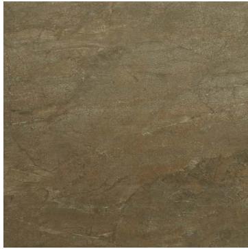
27224 12x12 Rye