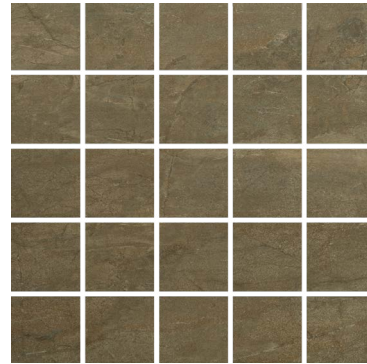
27224/M12 Rye 25pc Mosaic