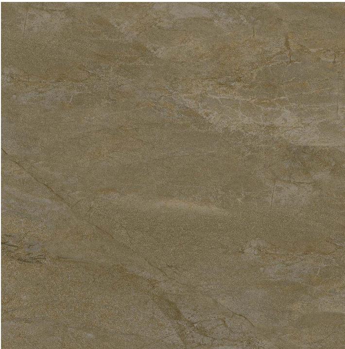
27224 24x24 Rye