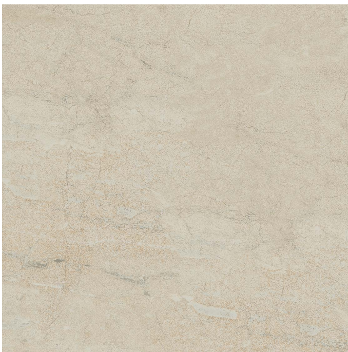
27202 24x24 Biscuit