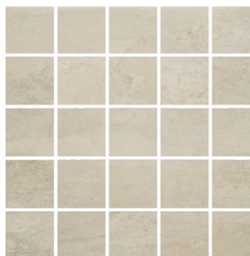
27202/M12 Biscuit 25pc Mosaic