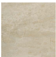
27202 6x6 Biscuit