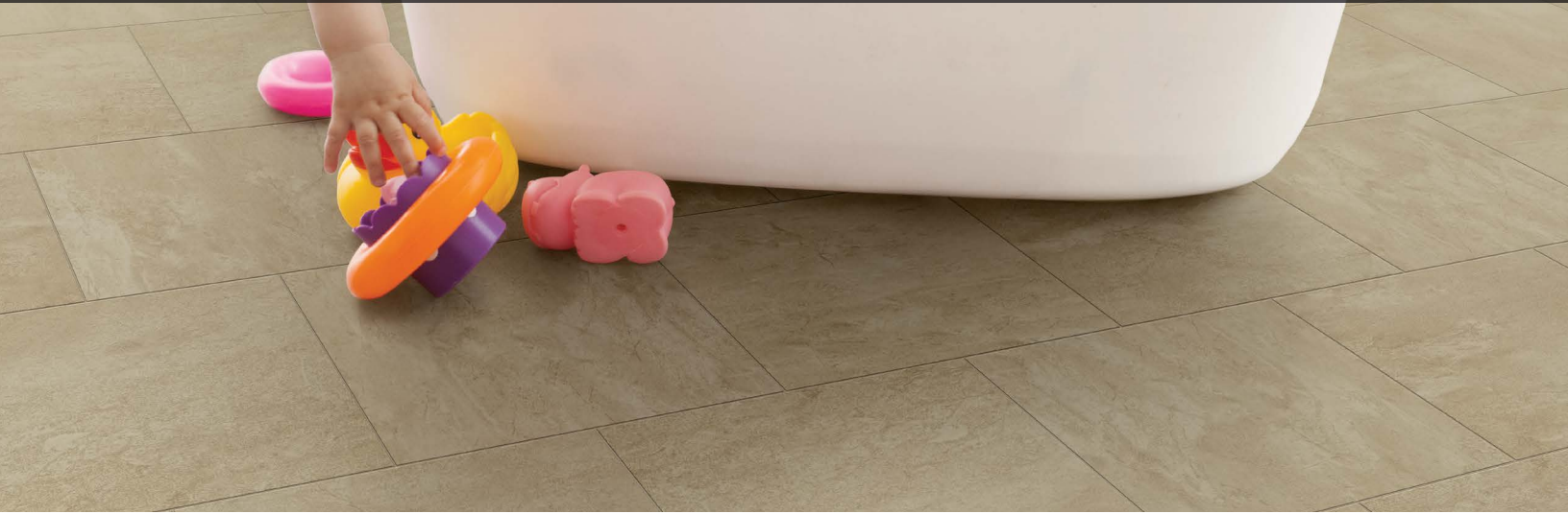
above: 27230 12x12 Wheat