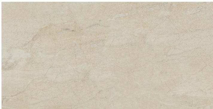
27202 12x24 Biscuit