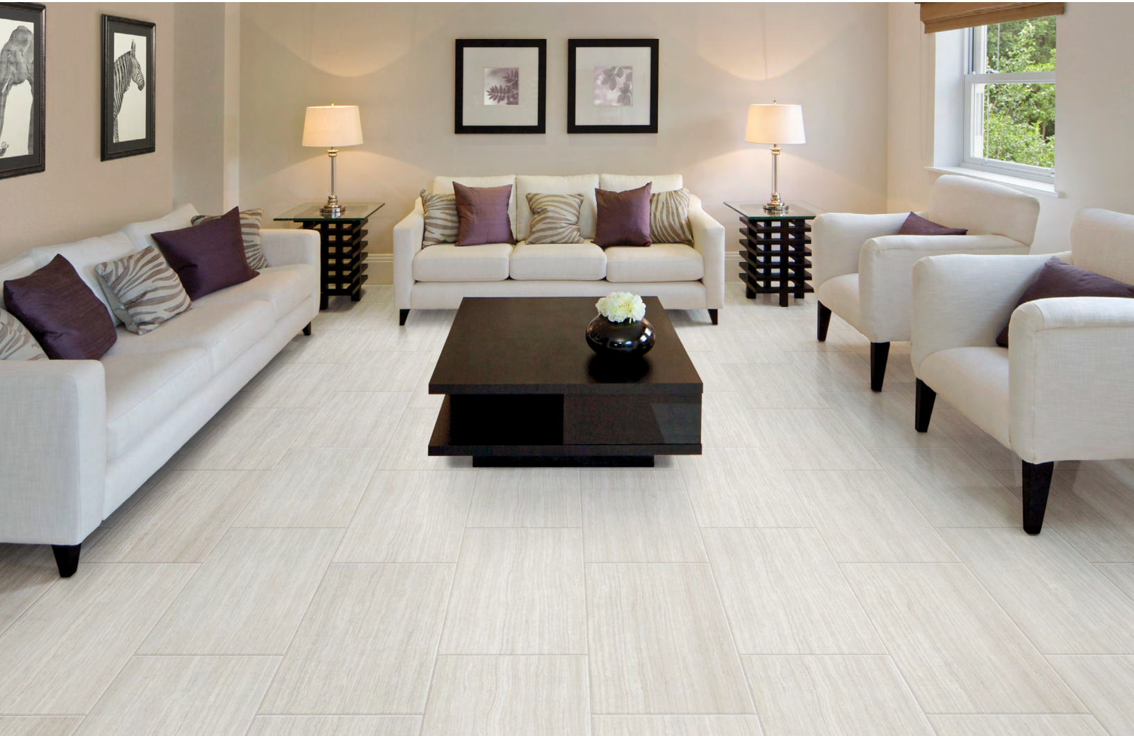
above: 28110 12x24 Sea Salt