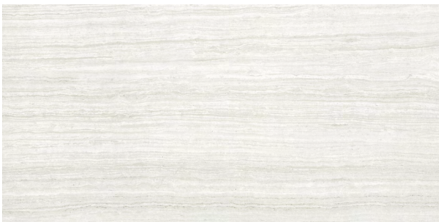
28110 12x24 Sea Salt