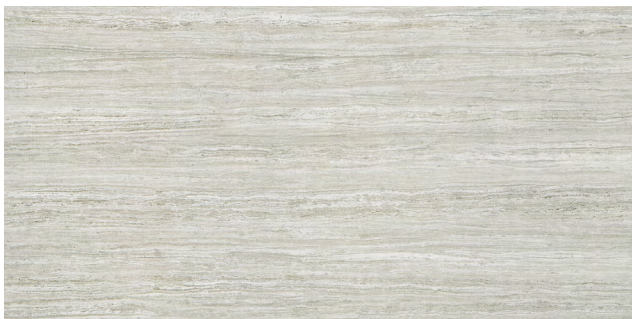
28115 12x24 Marine Fog