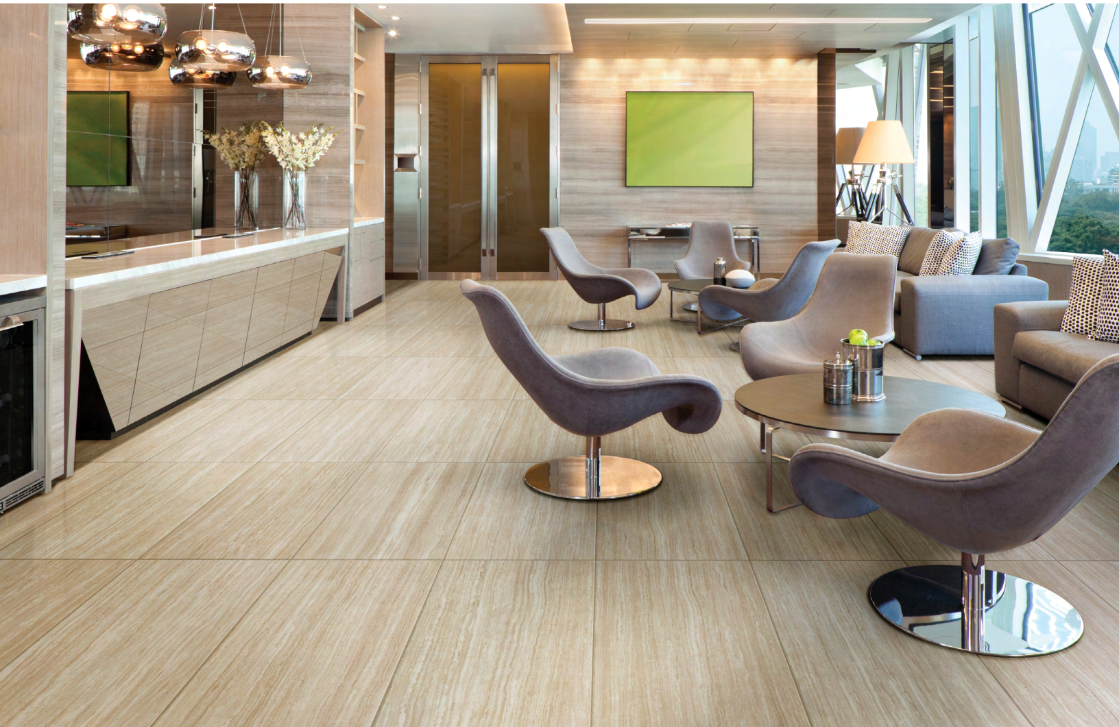
above: 28130 12x24 Sand Castle