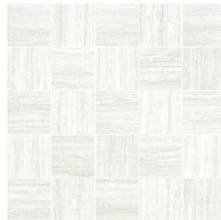
28110/M12 Sea Salt Mosaic