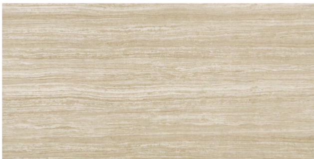
28130 12x24 Sand Castle