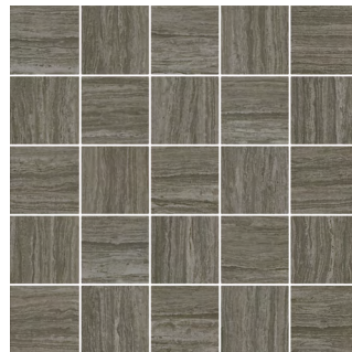
28190 /M12 Coconut Shell Mosaic