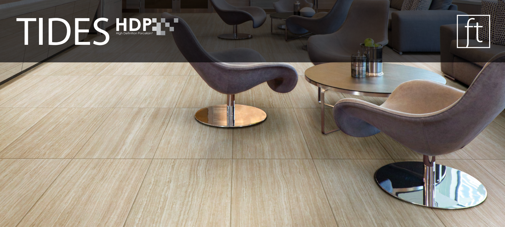
above: 28130 12x24 Sand Castle