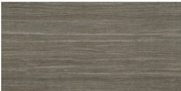
28190 12x24 Coconut Shell