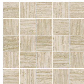
28130/M12 Sand Castle Mosaic