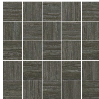
28155/M12 Waters Edge Mosaic