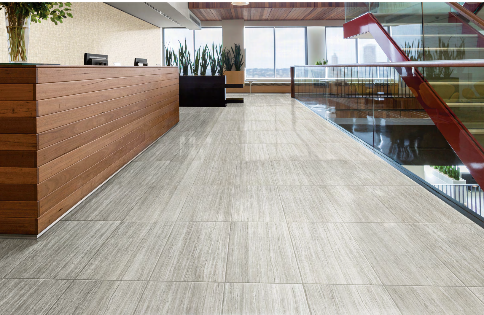
above: 28115 12x24 Marine Fog & 28130/M12 Sand Castle Mosaic