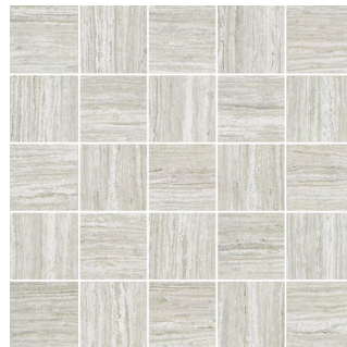
28115/M12 Marine Fog Mosaic