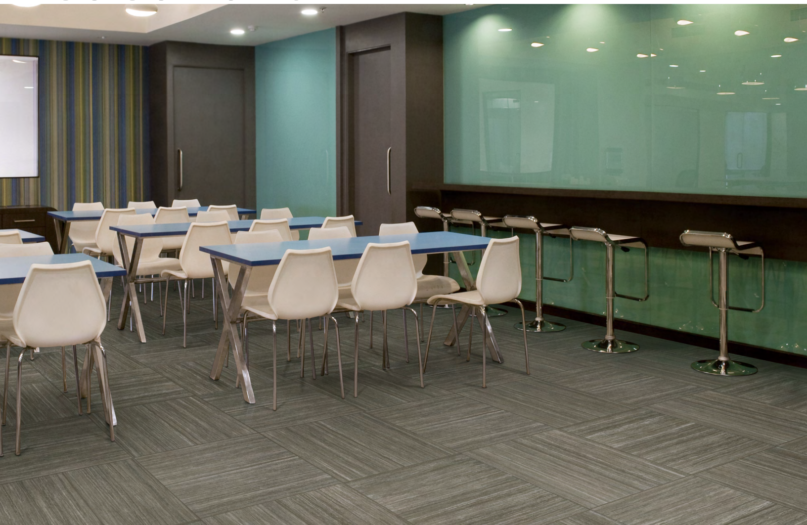
above: 28190 12x24 Coconut Shell