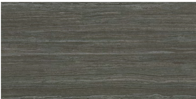
28155 12x24 Waters Edge