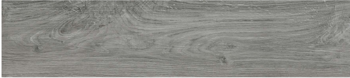
28315 8x36 Ash