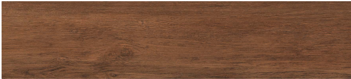
28325 8x36 Burl