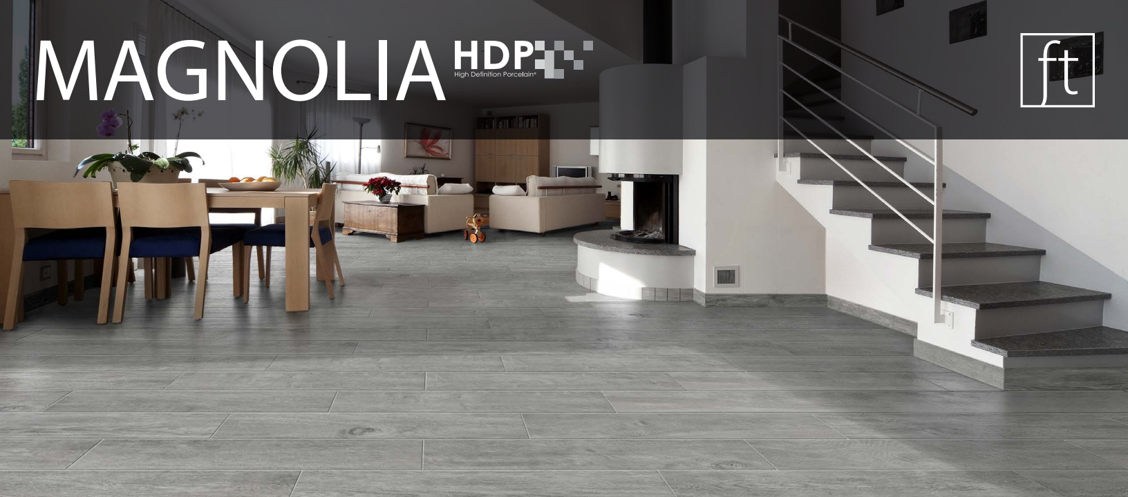
above: 28315 8x36 Ash