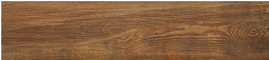
28327 8x36 Chestnut