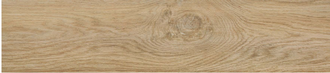
28338 8x36 Fir