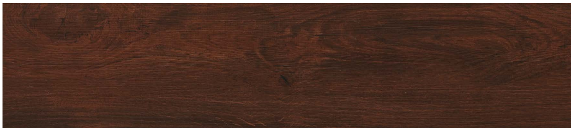
28378 8x36 Cherry