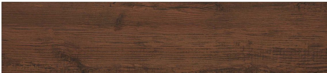
28395 8x36 Mahogany