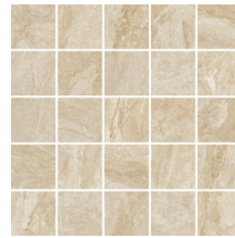
28434/M12 Soft Rock 25pc