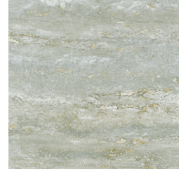
28460 Dry Stream