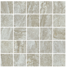
28412/M12 Cool Summer Mix 25pc