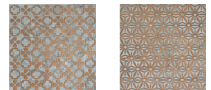
28401B/I6x6 Cool (set of two)