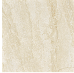
28430 Warm Winter Mix