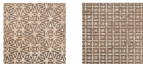
28400B/I6x6 Warm (set of two)