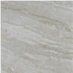
28412 Cool Summer Mix