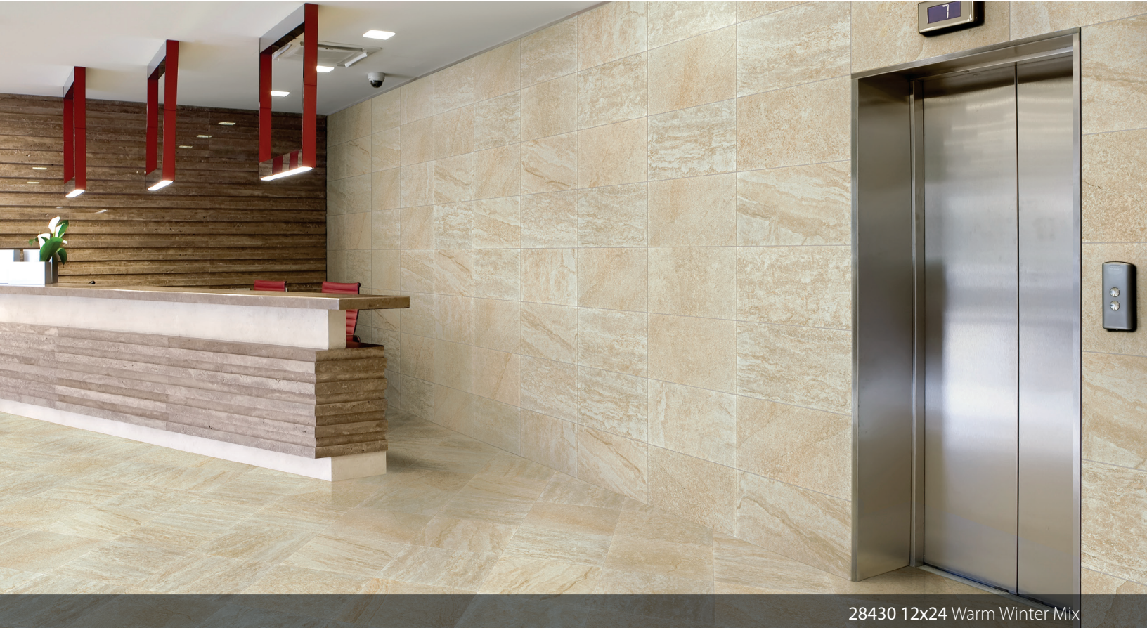
28430 12x24 Warm Winter Mix