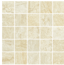
28430/M12 Warm Winter Mix 25pc