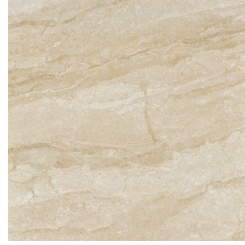
28434 Soft Rock