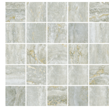
28460/M12 Dry Stream 25pc