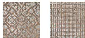
28401A/I6x6 Cool (set of two)