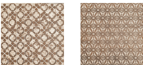
28400A/I6x6 Warm (set of two)