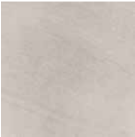
29615 12x12 Roman Gray