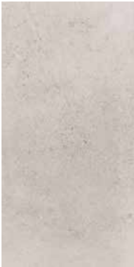
29615 12x24 Roman Gray