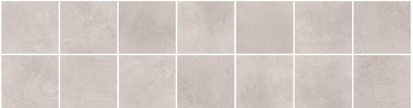
29615 Roman Gray