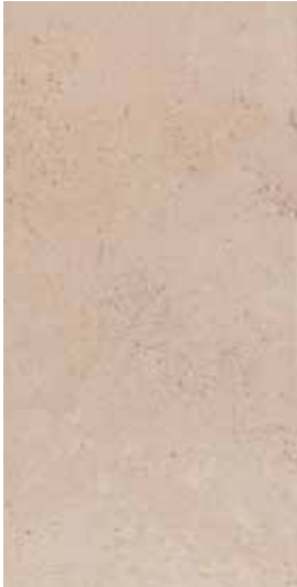
29626 12x24 Palma Brown