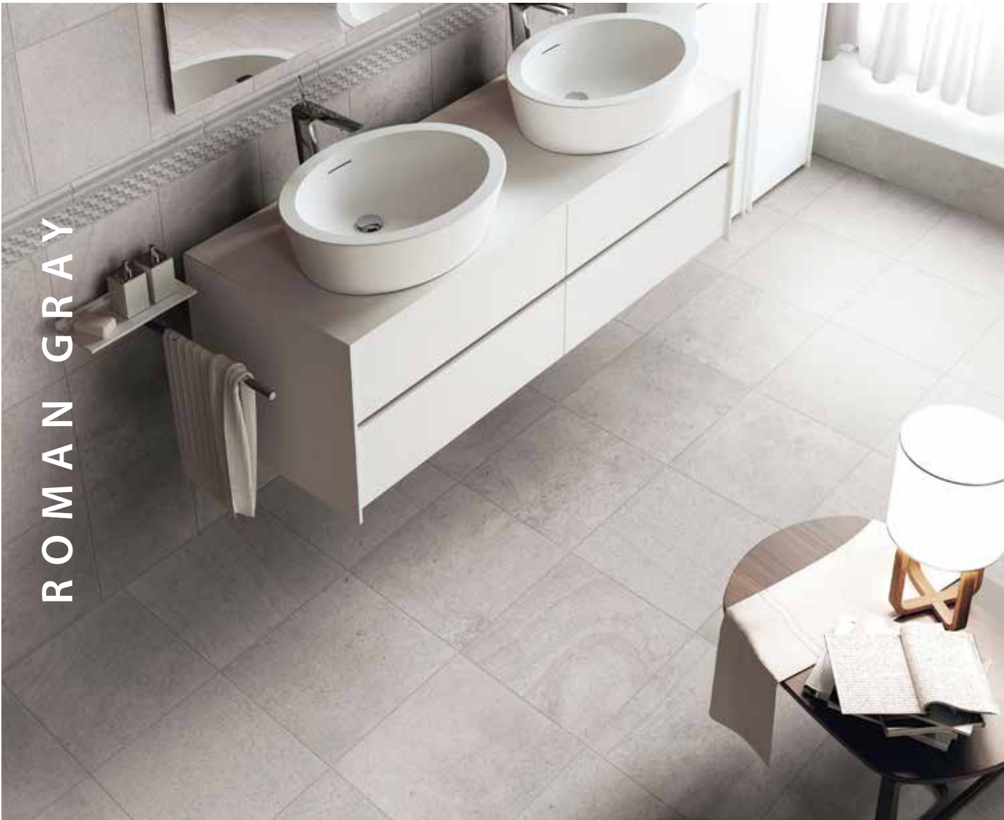
Shown: 29615 10x13 Roman Gray (ceramic), 29615 18x18 Roman Gray, 29600B/L2x10 Roundabout Cool, 29615CR2x10 Roman Gray Chair Rail