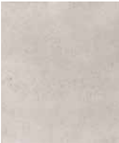
29615 10x13 Roman Gray (ceramic)