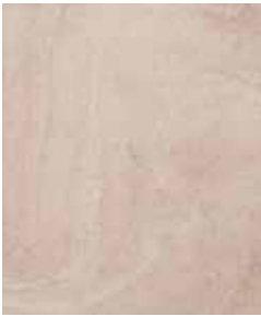
29622 10x13 Porto Cream (ceramic)