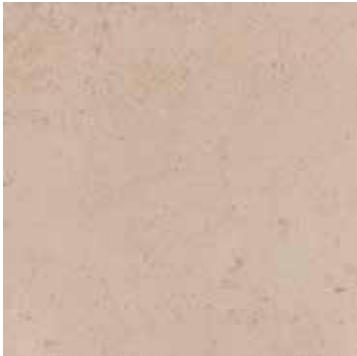
29626 18x18 Palma Brown