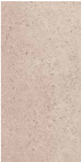
29622 12x24 Porto Cream