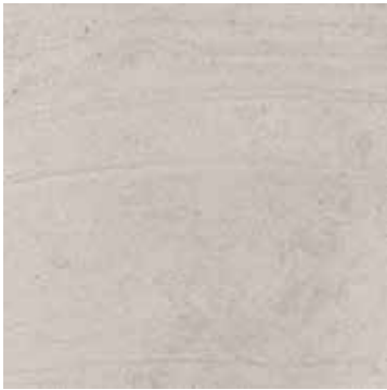
29615 18x18 Roman Gray