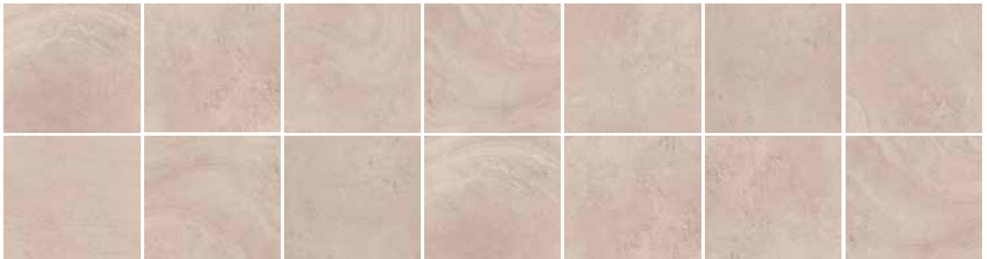
29622 Porto Cream