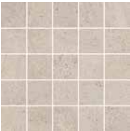
29622/M12 Porto Cream Mosaic