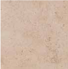
29626 12x12 Palma Brown