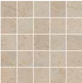
29626/M12 Palma Brown Mosaic