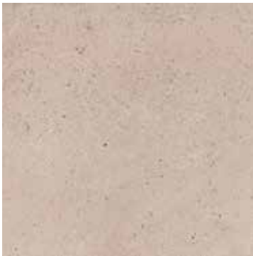
29622 18x18 Porto Cream