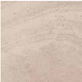
29622 12x12 Porto Cream