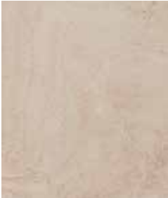
29626 10x13 Palma Brown (ceramic)