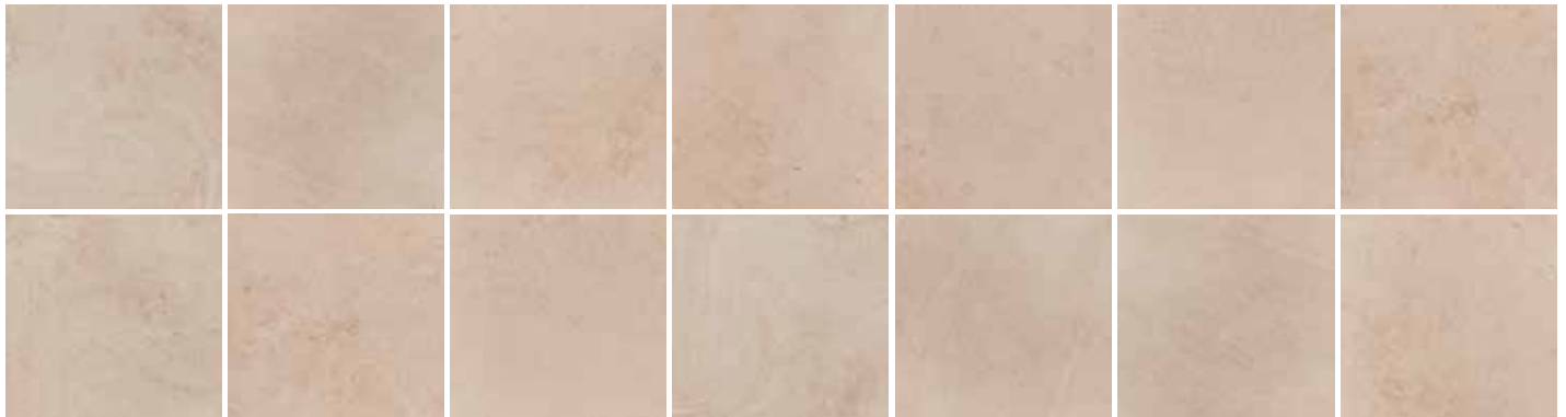
29626 Palma Brown

With the exception of select trim, decorative and ceramic pieces, this product line is Made in the USA of 40% pre-consumer recycled content, is GREENGUARD Certified and Porcelain Tile Certified, and meets the new DCOF AcuTest requirements to be installed in wet areas.