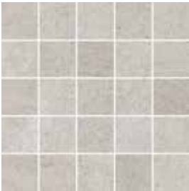
29615/M12 Roman Gray Mosaic