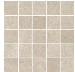
29615/M12 25pc Mosaic