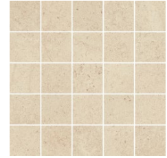
29622/M12 25pc Mosaic