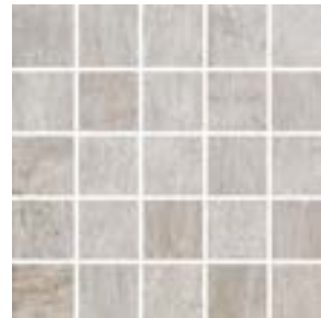
29914/M12 Delta Haze Mosaic