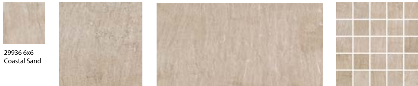
29936 6x6 Coastal Sand