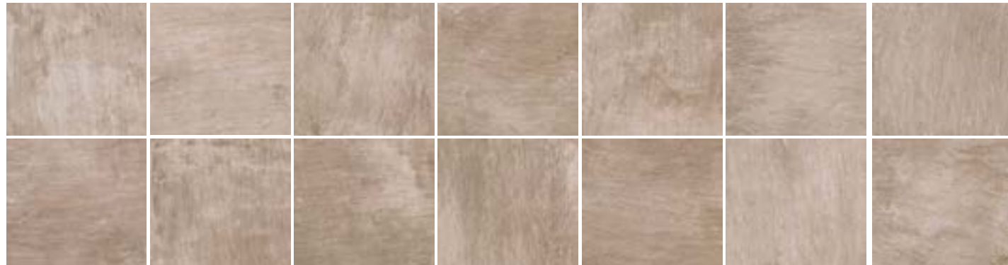
29927 Sierra Clay