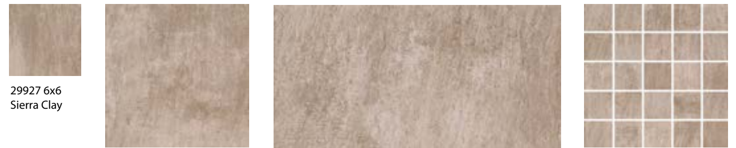
29927 6x6 Sierra Clay