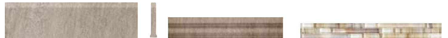
29927/P36C9 & PB3169 Sierra Clay