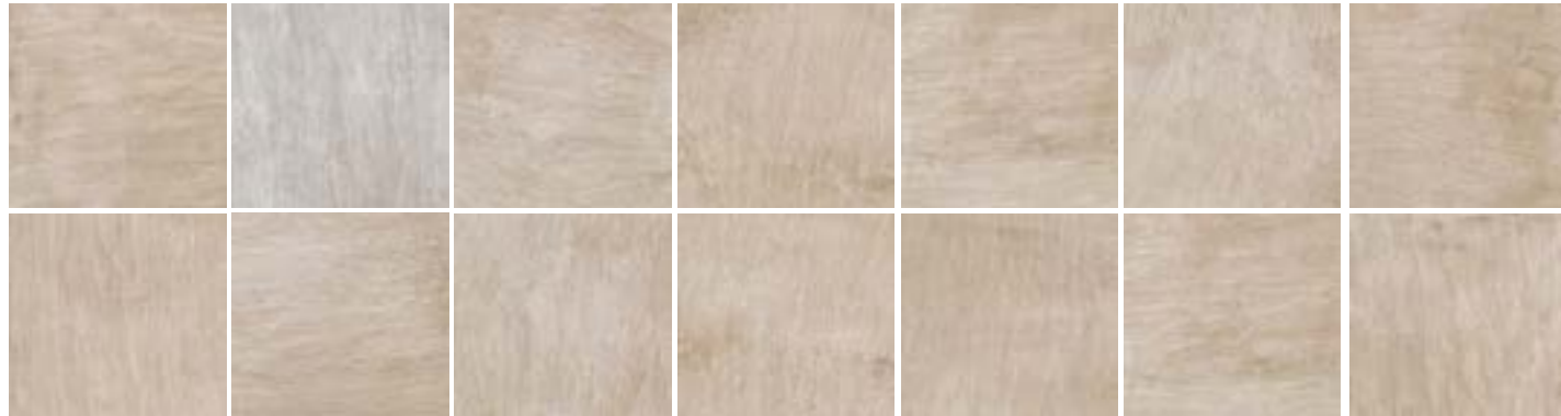
29936 Coastal Sand

The product line also includes a glass listello to match all three colors, M12 mosaic and full bullnose package. With the exception of select trim and decorative pieces, this product line is Made in the USA of 40% pre-consumer recycled content, is GREENGUARD ® Certified and Porcelain Tile Certified, and meets the new DCOF AcuTest requirements to be installed in wet areas.