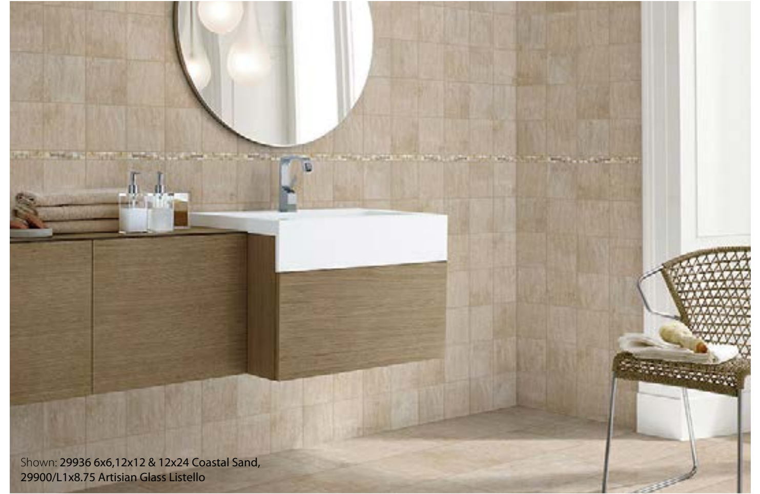
Shown: 29936 6x6, 12x12 & 12x24 Coastal Sand, 29900/L1x8.75 Artisan Glass Listello