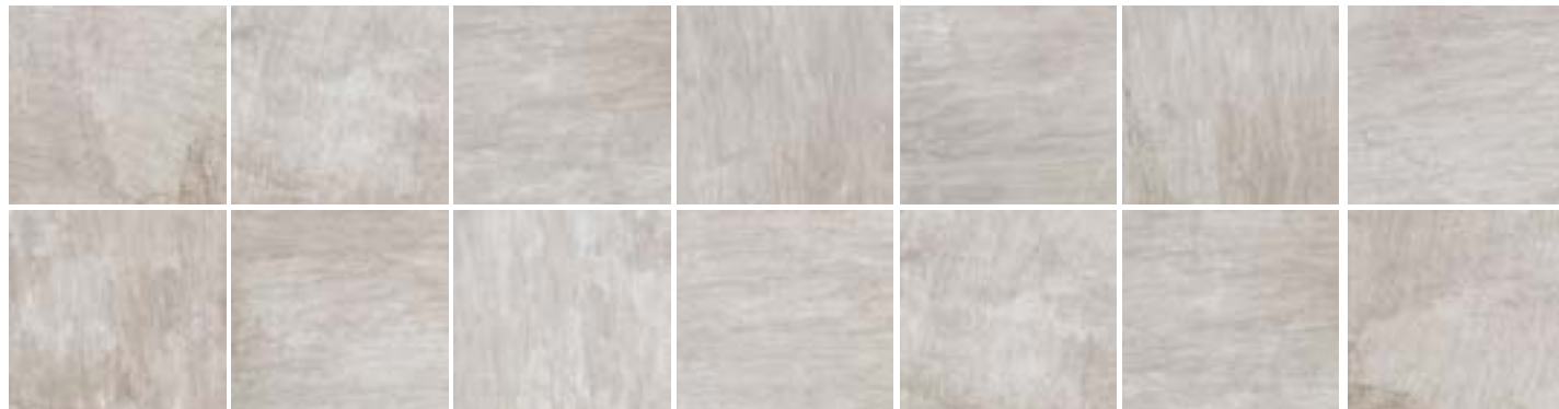
29914 Delta Haze

Shown on Cover: 29927 6x6 & 12x12 Sierra Clay, 29900/L1x8.75 Artesian Glass Listello