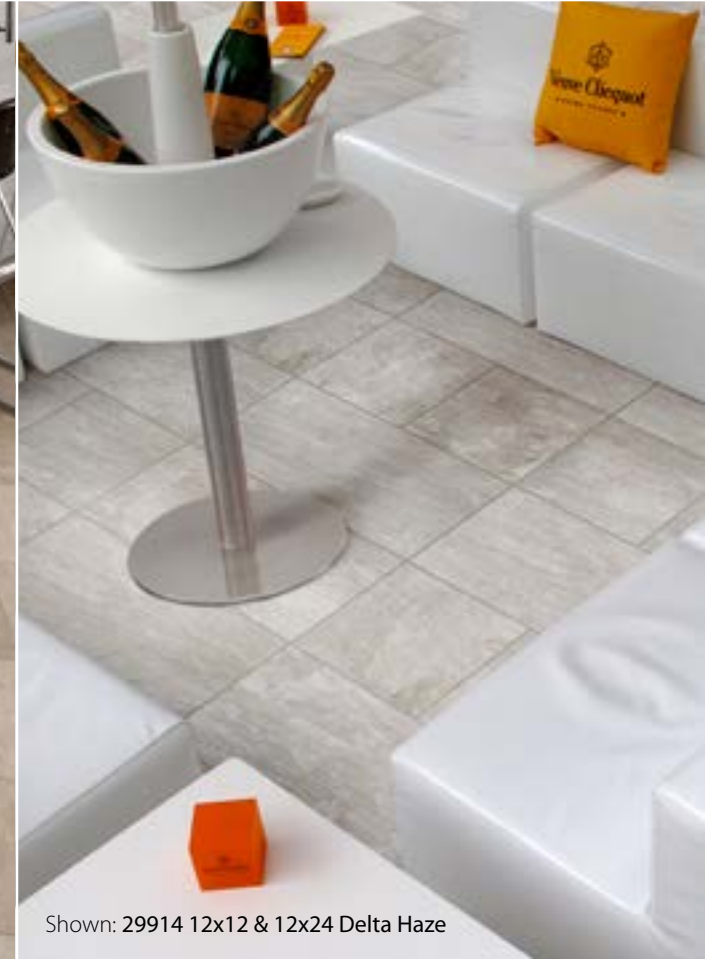
Shown: 29914 12x12 & 12x24 Delta Haze