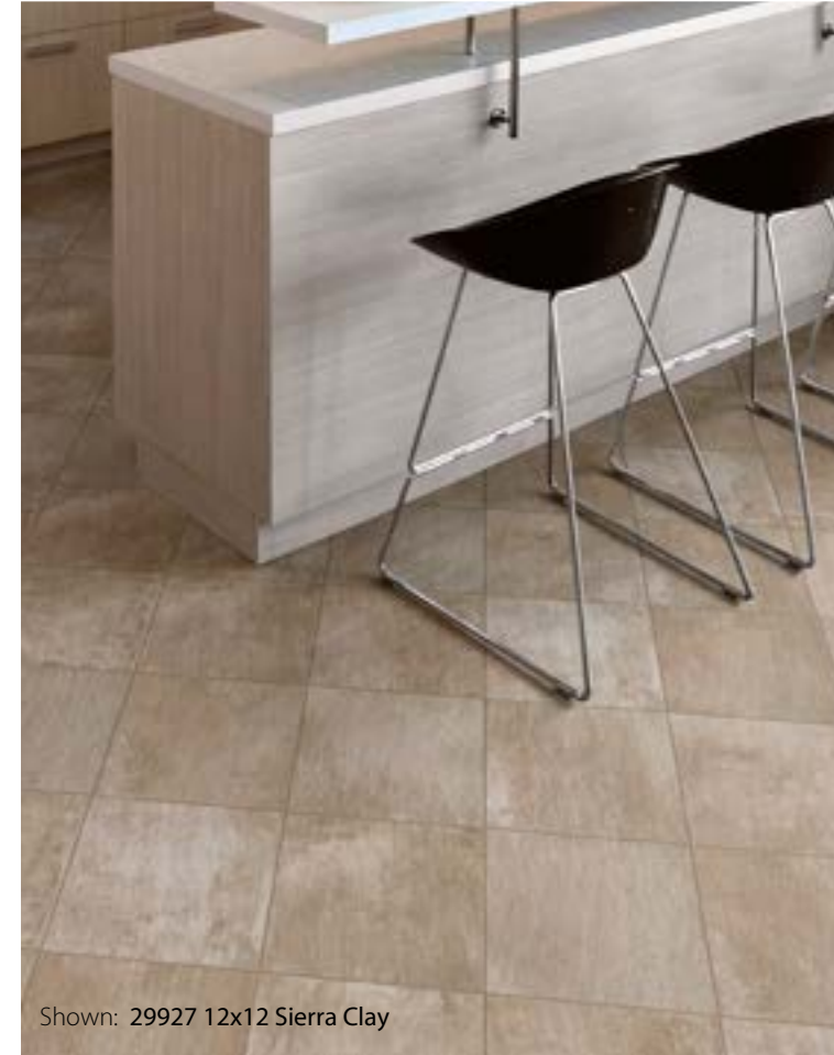
Shown: 29927 12x12 Sierra Clay