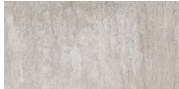
29914 12x24 Delta Haze