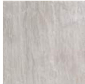
29914 12x12 Delta Haze