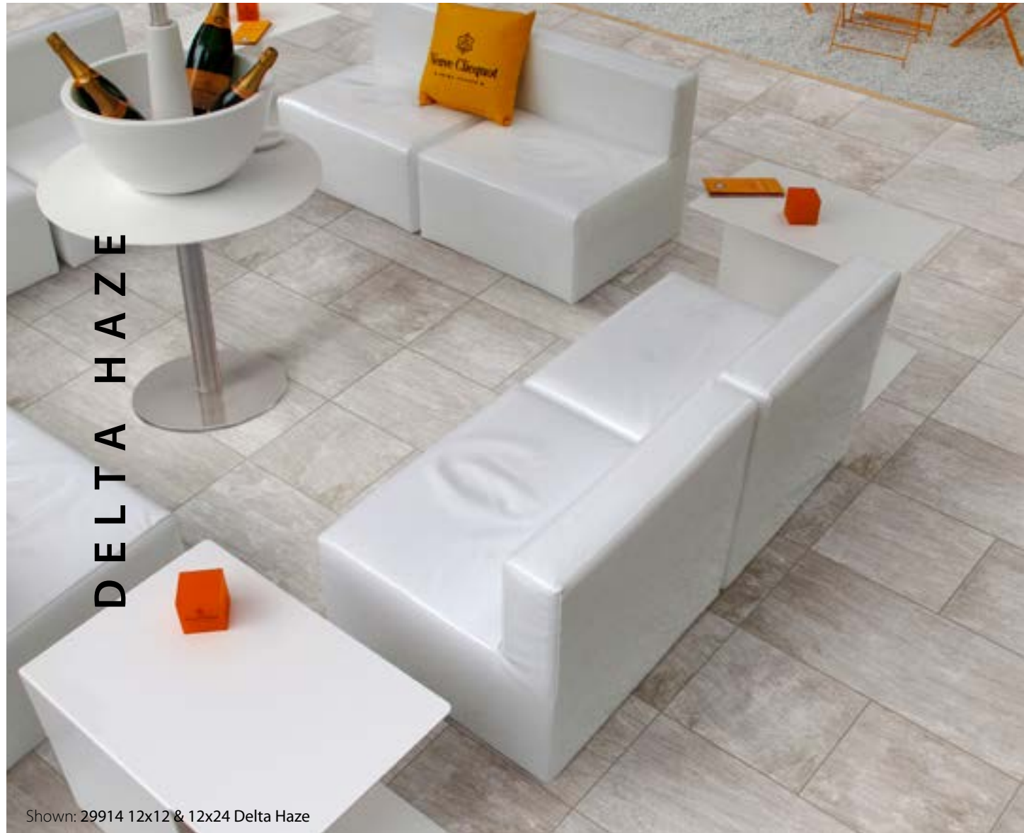
Shown: 29914 12x12 & 12x24 Delta Haze