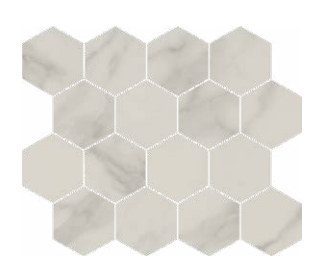
ENC10/M3x3HEX (polished) ENC1P/M3x3HEX (polished) Honesty Hexagon Mosaic (available in all colors)