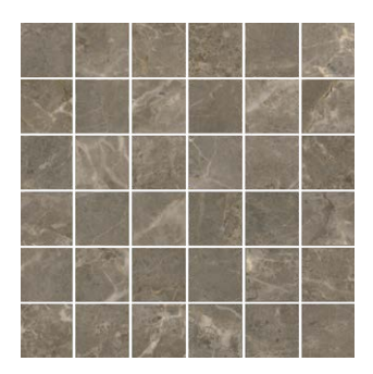
ENC40/M122 Charm 36pc Mosaic (matte only)