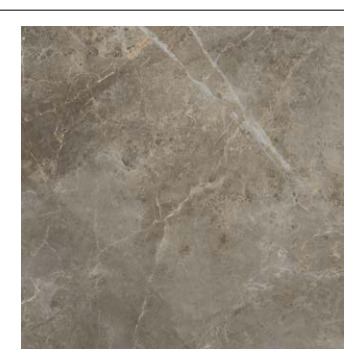
ENC40 Charm (polished)