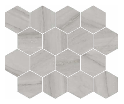
ENC30/M3x3HEX ENC3P/M3x3HEX (polished) Beauty Hexagon Mosaic