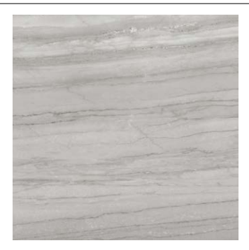
ENC30 Beauty ENC3P Beauty (polished)