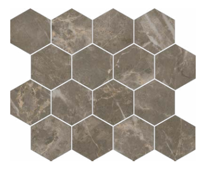
ENC40M3x3HEX ENC4P/M3x3HEX (polished) Charm Hexagon Mosaic