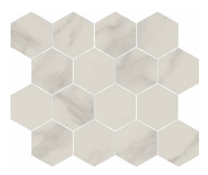
ENC10/M3x3HEX ENC1P/M3x3HEX (polished) Honesty Hexagon Mosaic