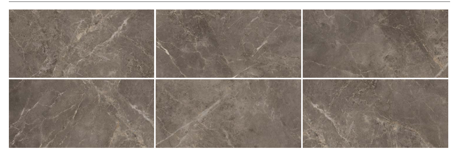
ENC40 Charm (polished)