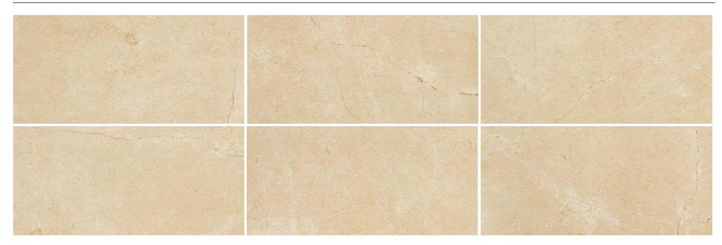
ENC20 Grace (polished)