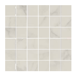
ENC10/M122 Honesty 36pc Mosaic (matte only) (available in all colors)