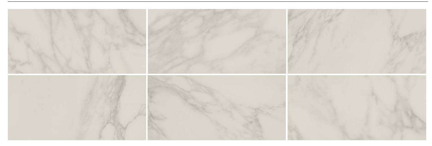
ENC10 Honesty ENC1P Honesty (polished)