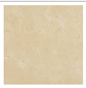
ENC20 Grace (polished)