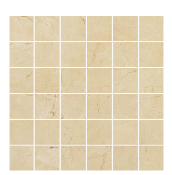
ENC20/M122 Grace 36pc Mosaic (matte only)