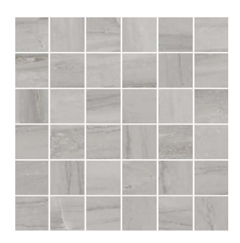
ENC30/M122 Beauty 36pc Mosaic (matte only)