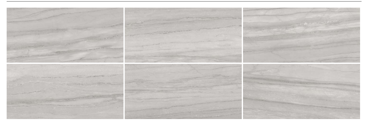
ENC30 Beauty ENC3P Beauty (polished)