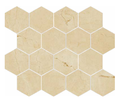
ENC20/M3x3HEX ENC2P/M3x3HEX (polished) Grace Hexagon Mosaic