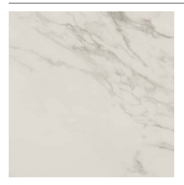
ENC10 Honesty ENC1P Honesty (polished)