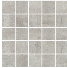
33315/M12 25pc Mosaic