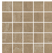
33318/M12 25pc Mosaic