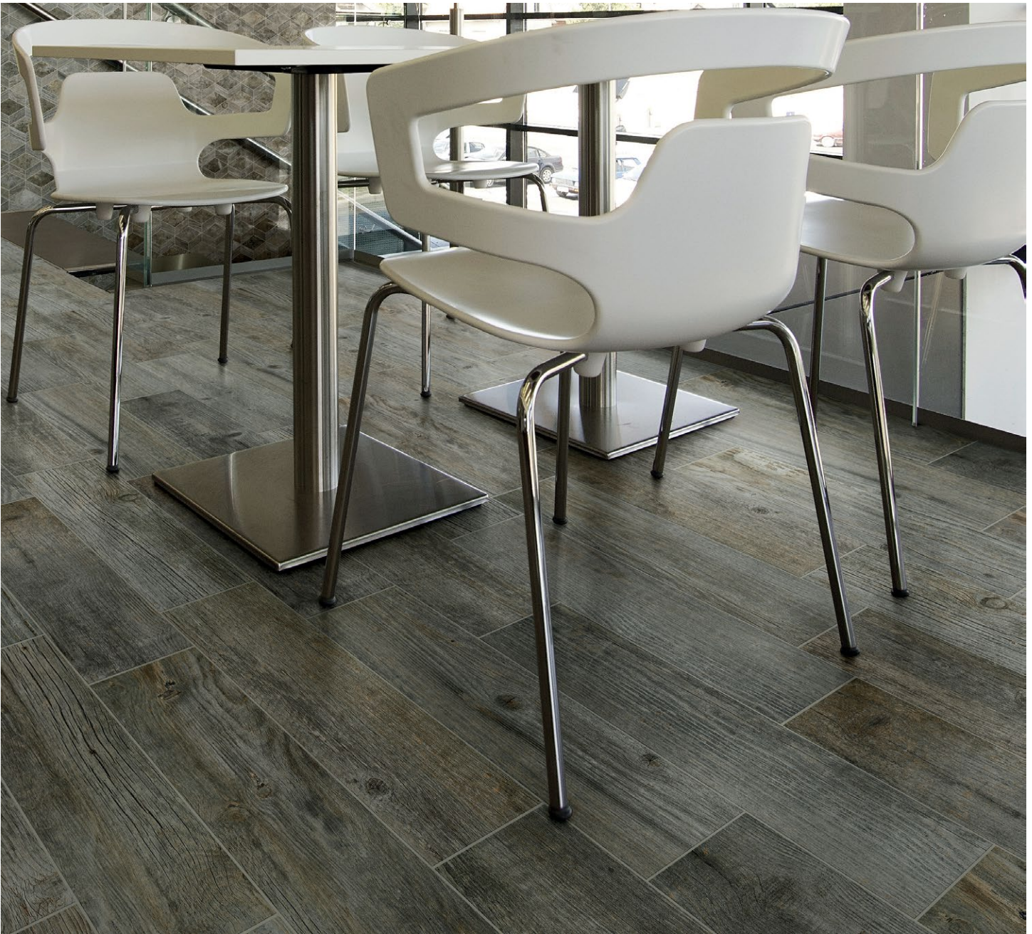
Shown: 33512 8x36 Cottage

Alava HDP is named after a region in Northwestern Spain, known for its rugged, rocky landscape and tradition of producing of high quality lumber. Appropriately, the Alava HDP collection from Florida Tile features 6x24 and 8x36 planks composed of a rustic reclaimed wood graphic complete with nail holes, worn-in stains and a soft wood grain texture. Both sizes are available in three timeworn, beautiful colors – Cottage, Lodge, and Villa.