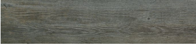
33512 8x36 Cottage