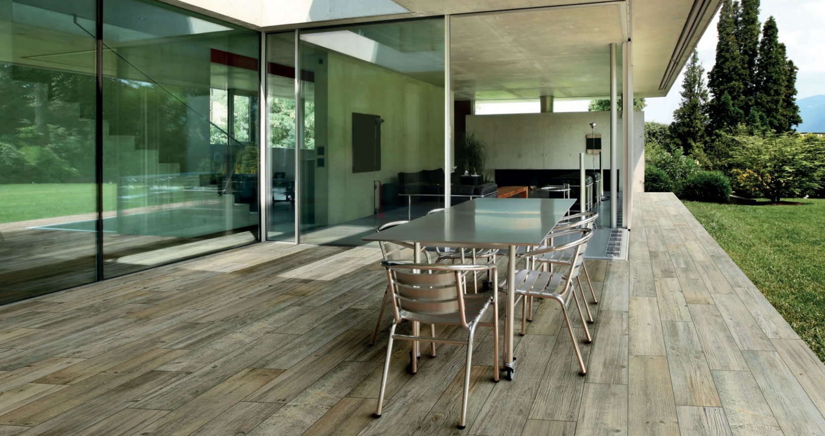
Shown: 33533 8x36 Villa