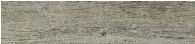
33533 8x36 Villa