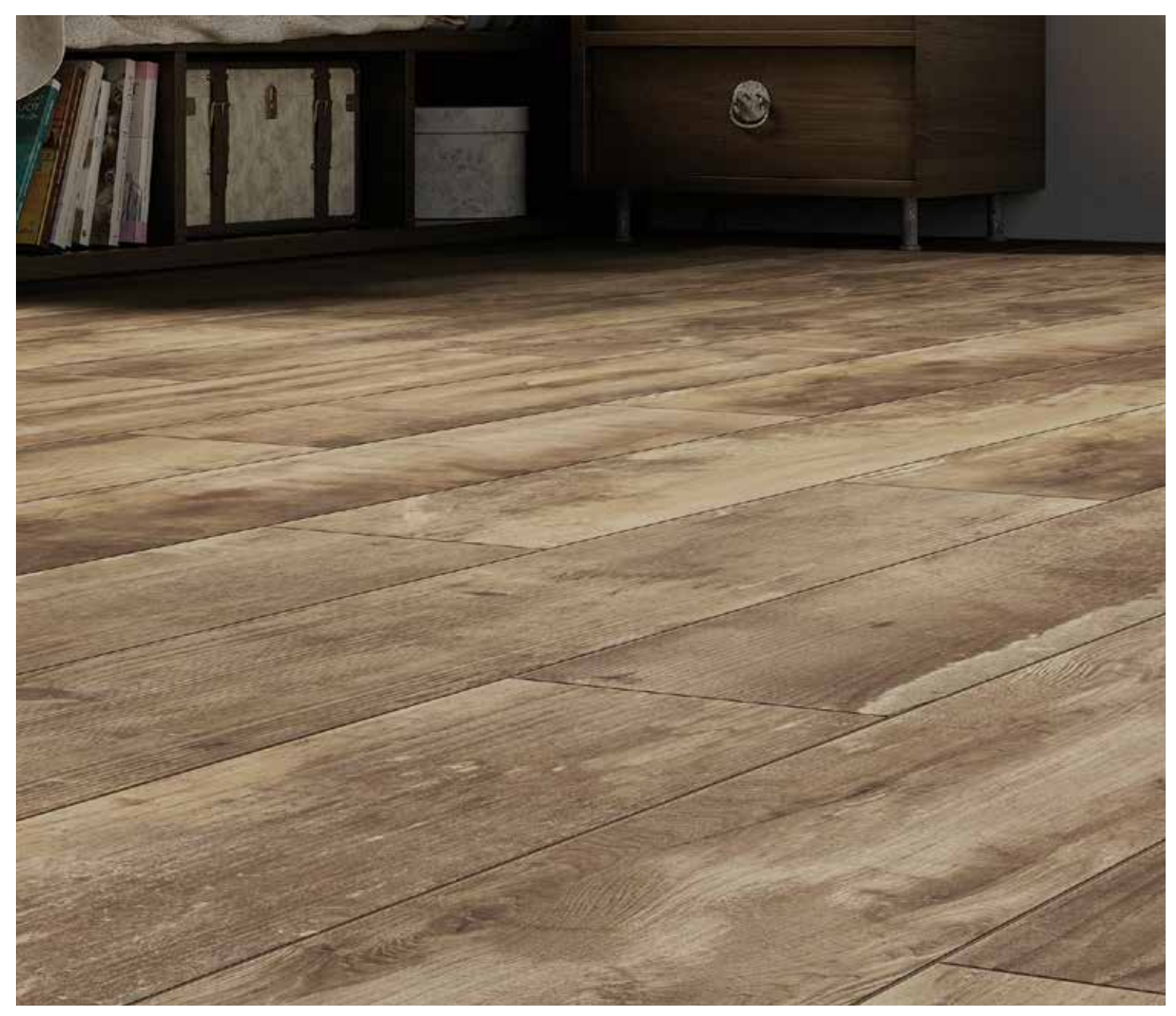
Shown: 34193 8x48 Montana