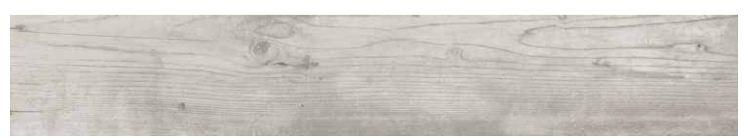
34112 8x48 Alaska