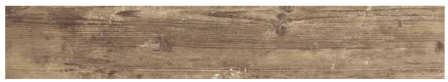
34193 8x48 Montana