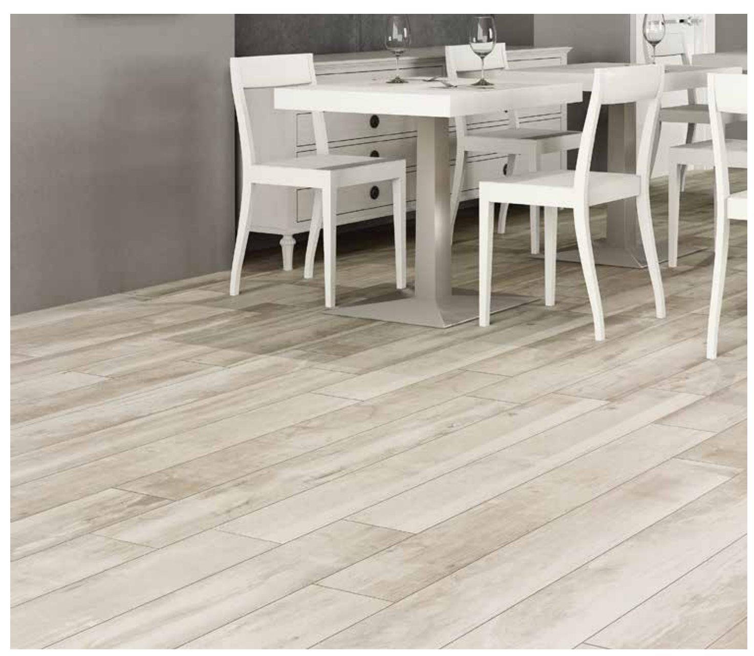
Shown: 34132 8x48 Florida