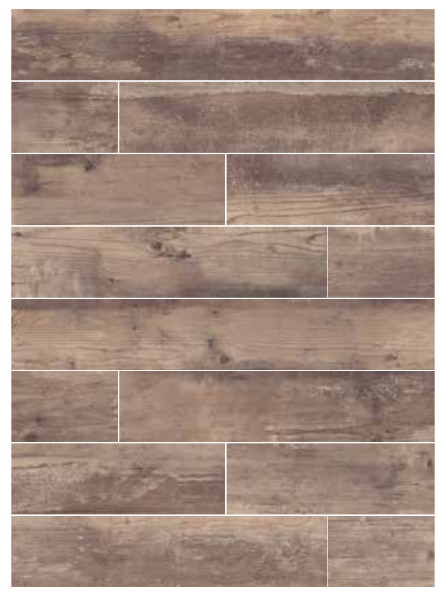
34193 Montana 34