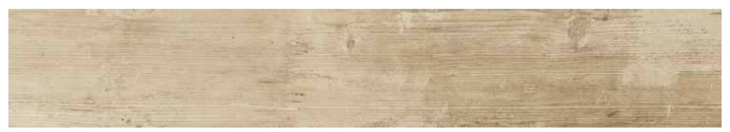
34123 8x48 Oregon