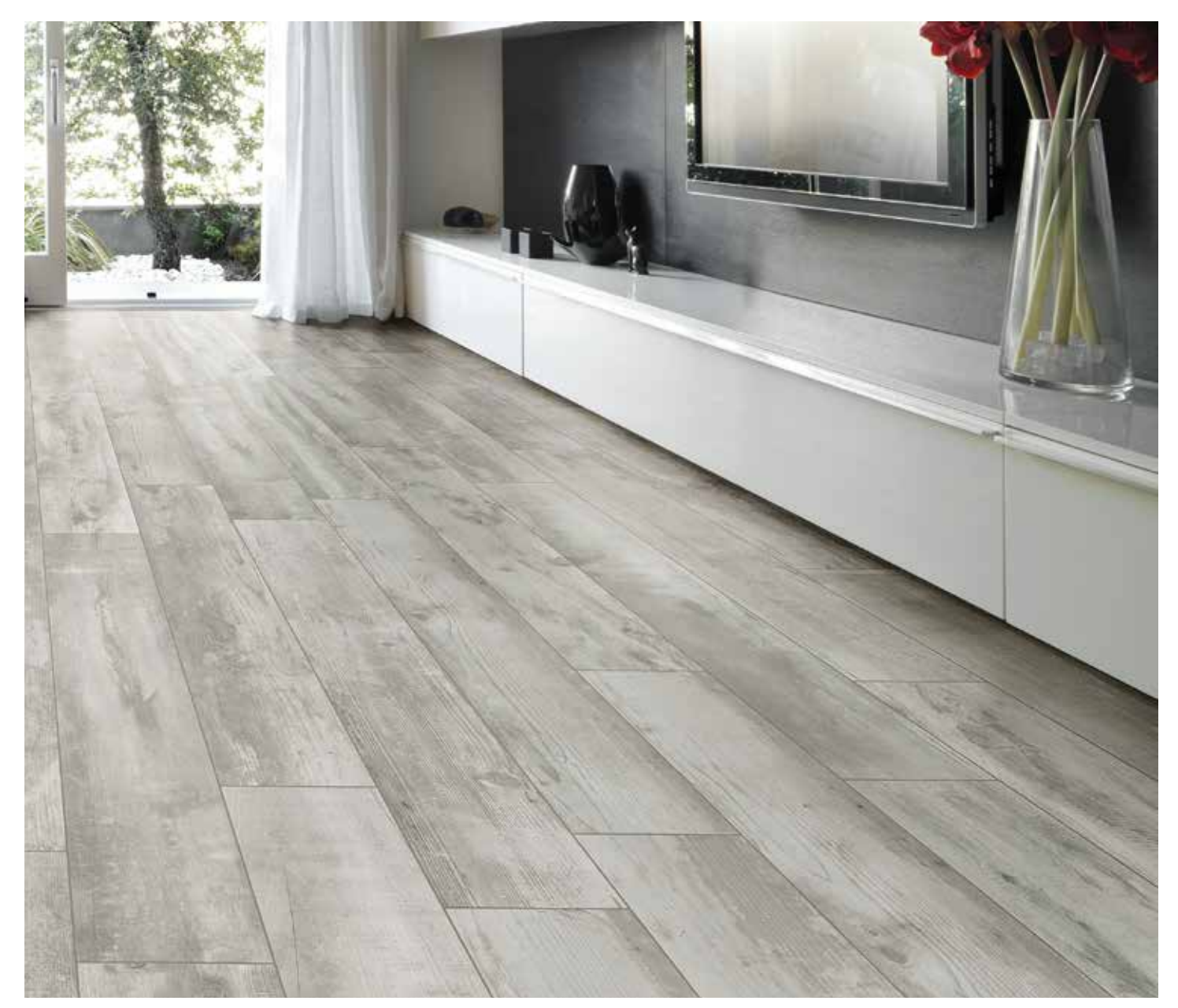
Shown: 34112 8x48 Alaska