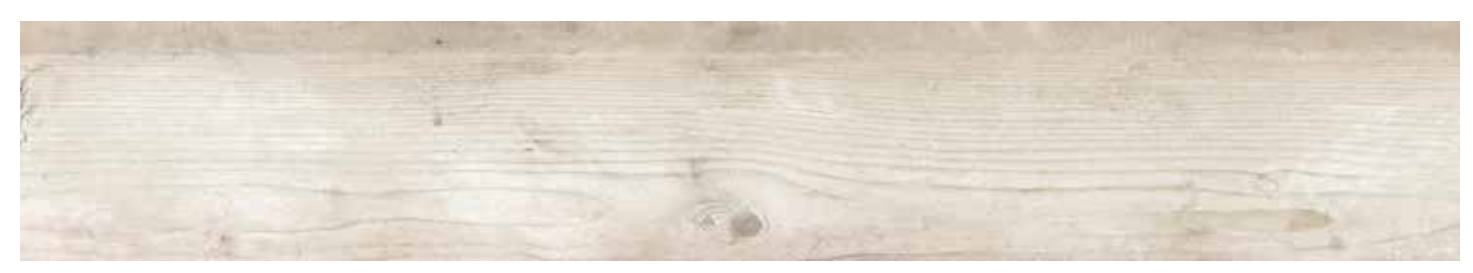
34132 8x48 Florida