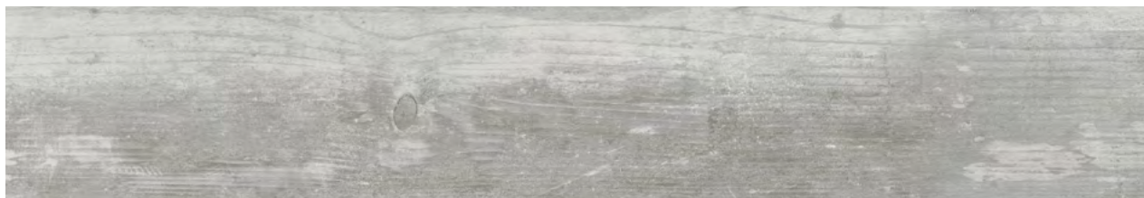
34112 8x48 Alaska