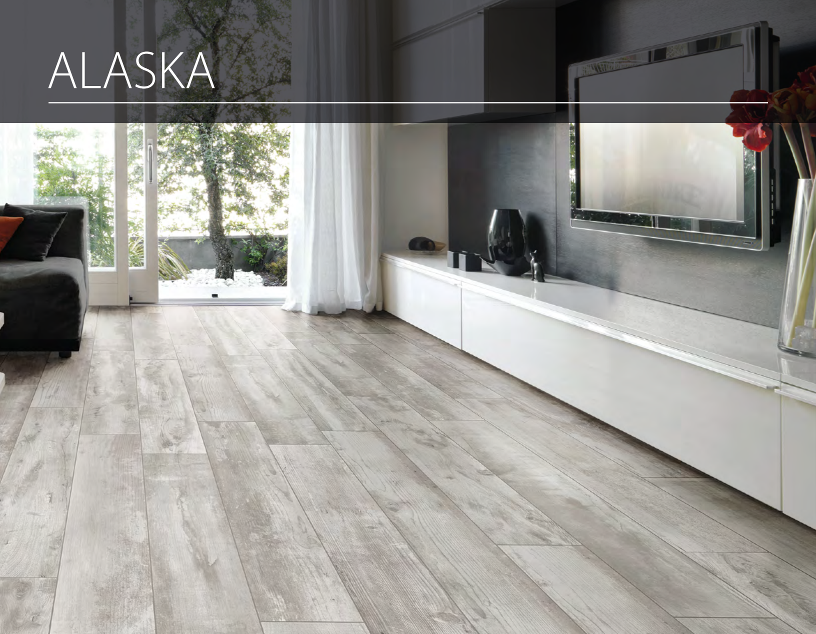
above: 34112 8x48 Alaska