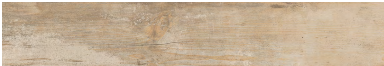
34123 8x48 Oregon