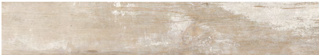
34132 8x48 Florida