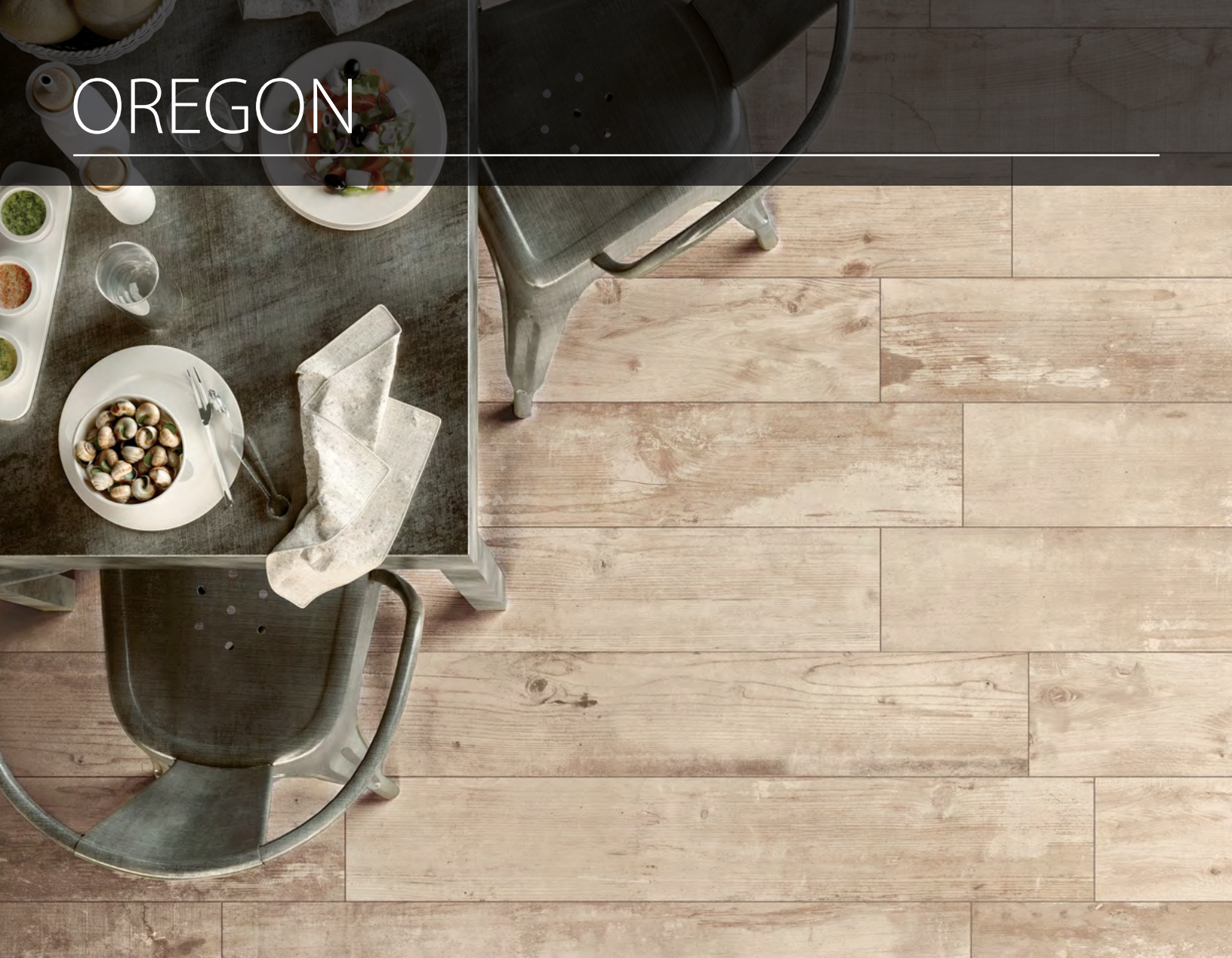
above: 34123 8x48 Oregon