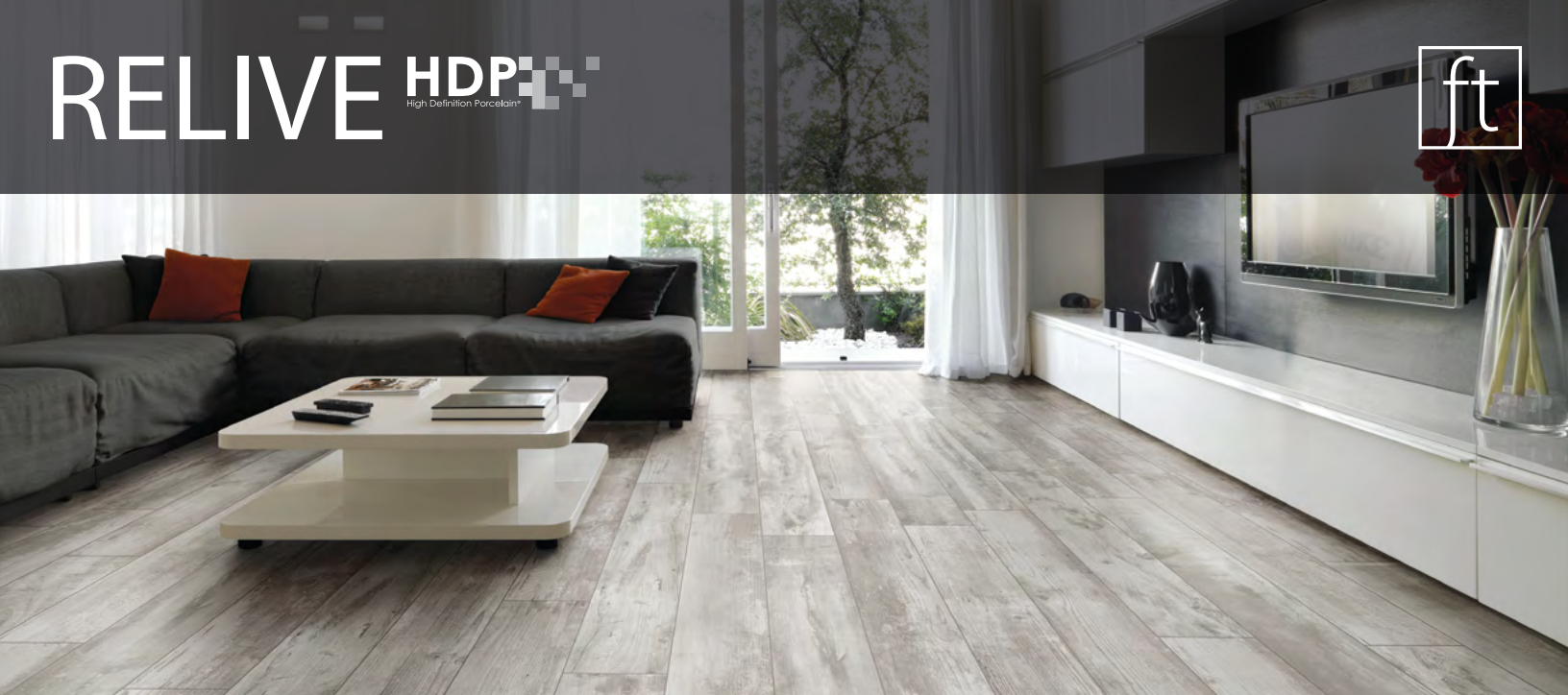
above: 34112 8x48 Alaska