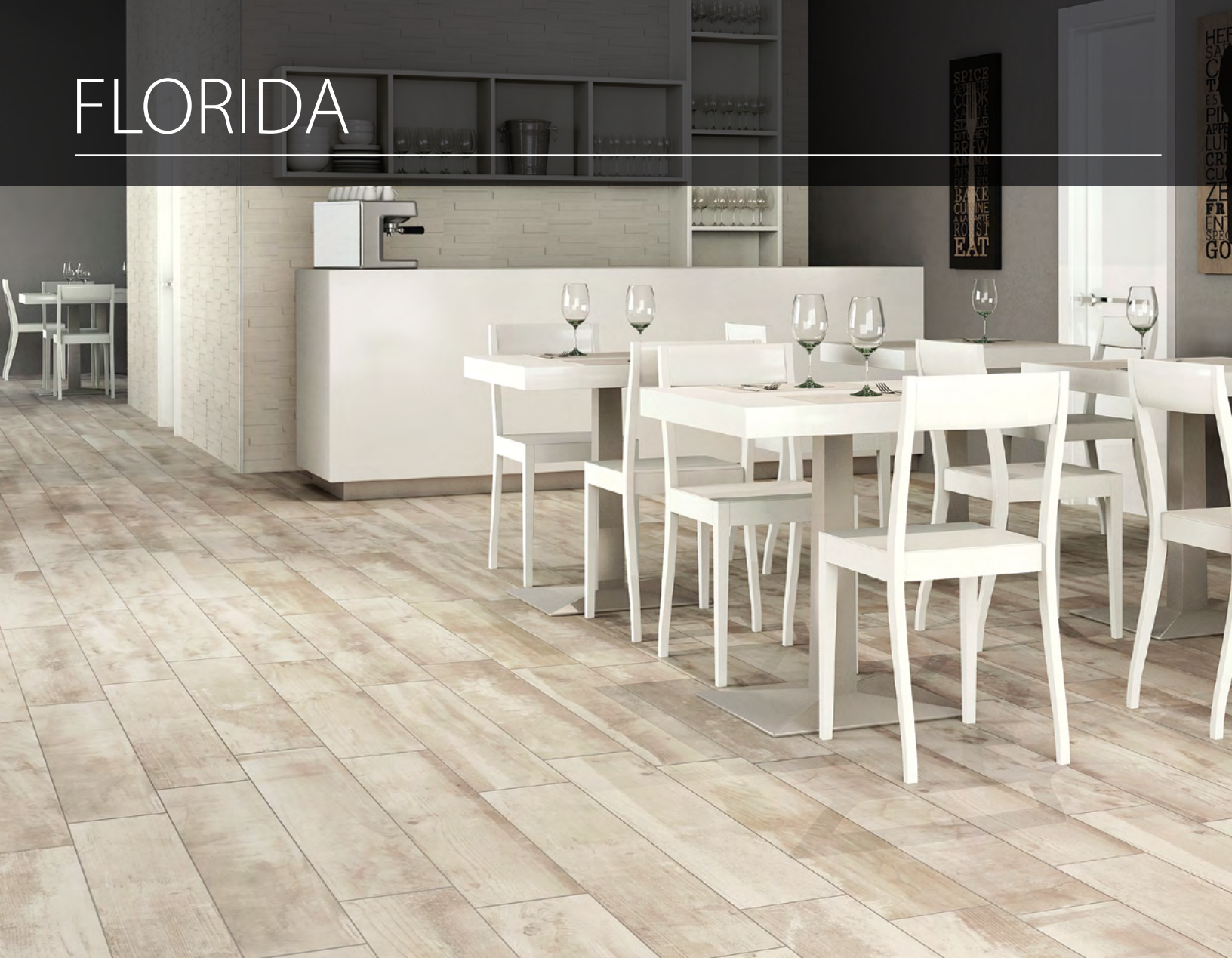
above: 34132 8x48 Florida