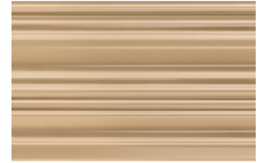
60325/CR4x6 & 60325/CRS4x1.5 Chair Rail & Chair Rail Stop (not shown)