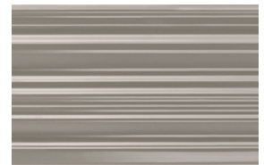
60366/CR4x6 & 60366/CRS4x1.5 Chair Rail & Chair Rail Stop (not shown)