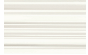
60301/CR4x6 & 60301/CRS4x1.5 Chair Rail & Chair Rail Stop (not shown)