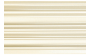
60302/CR4x6 & 60302/CRS4x1.5 Chair Rail & Chair Rail Stop (not shown)