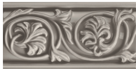
60366/L3x6 Floral Listello