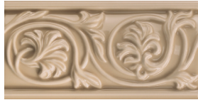
60325/L3x6 Floral Listello