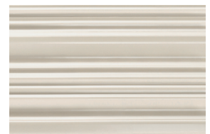
60312/CR4x6 & 60312/CRS4x1.5 Chair Rail & Chair Rail Stop (not shown)