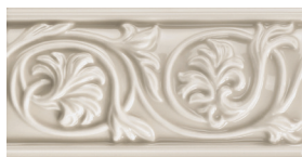
60312/L3x6 Floral Listello