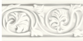
60301/L3x6 Floral Listello