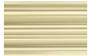
60359/CR4x6 & 60359/CRS4x1.5 Chair Rail & Chair Rail Stop (not shown)