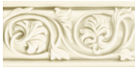
60302/L3x6 Floral Listello