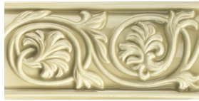
60359/L3x6 Floral Listello