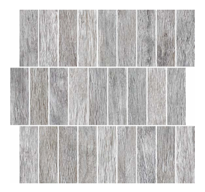
34310/M1x4STK Bleach Stack Mosaic

34310/M2x12HER Bleach Herringbone Mosaic