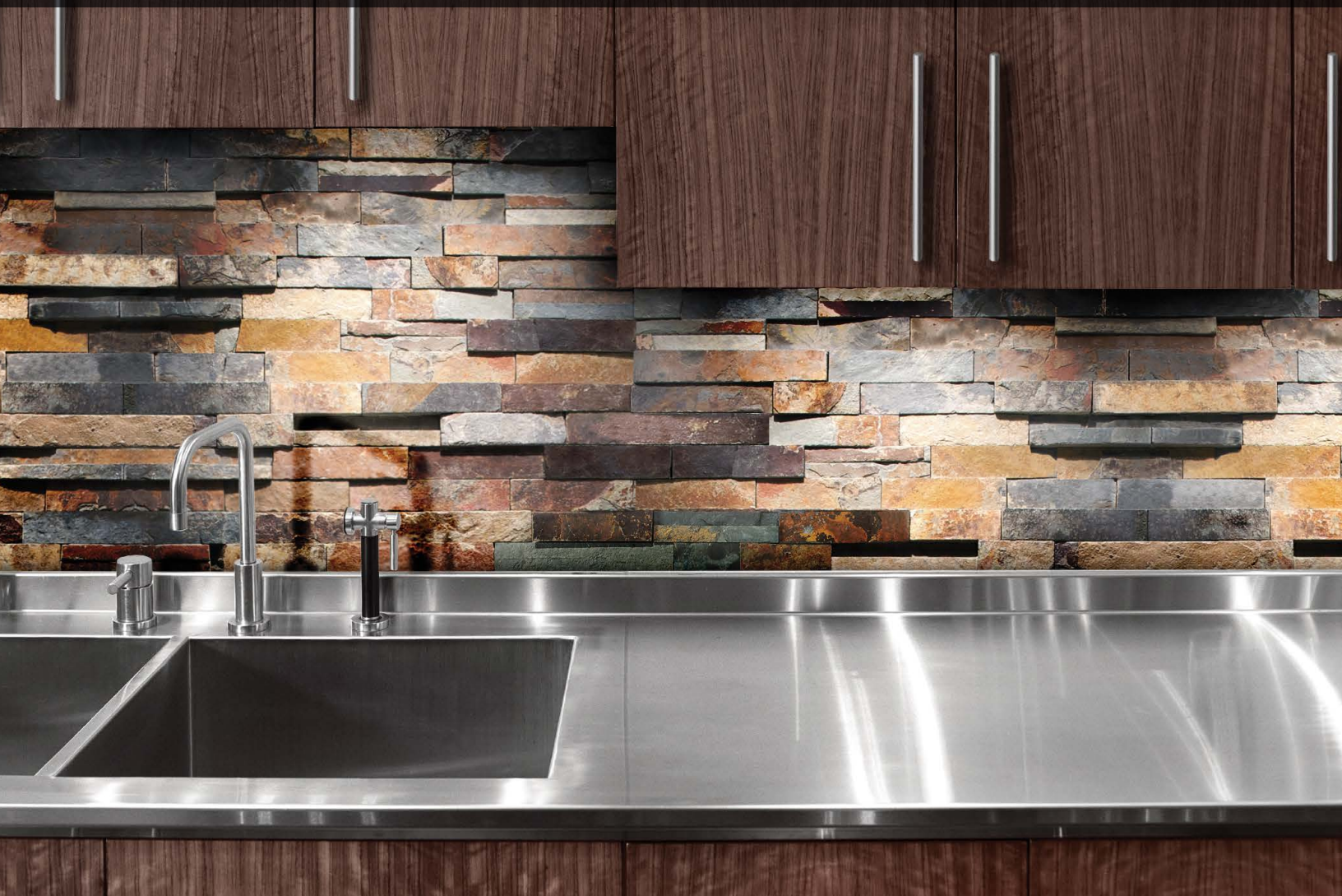
above: NS302/L6x24 Ember splitface