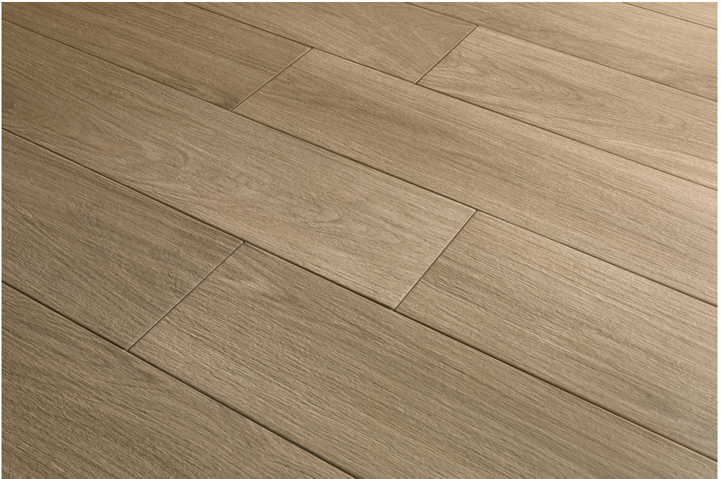
Shown: DIS10 8x48 Wheat