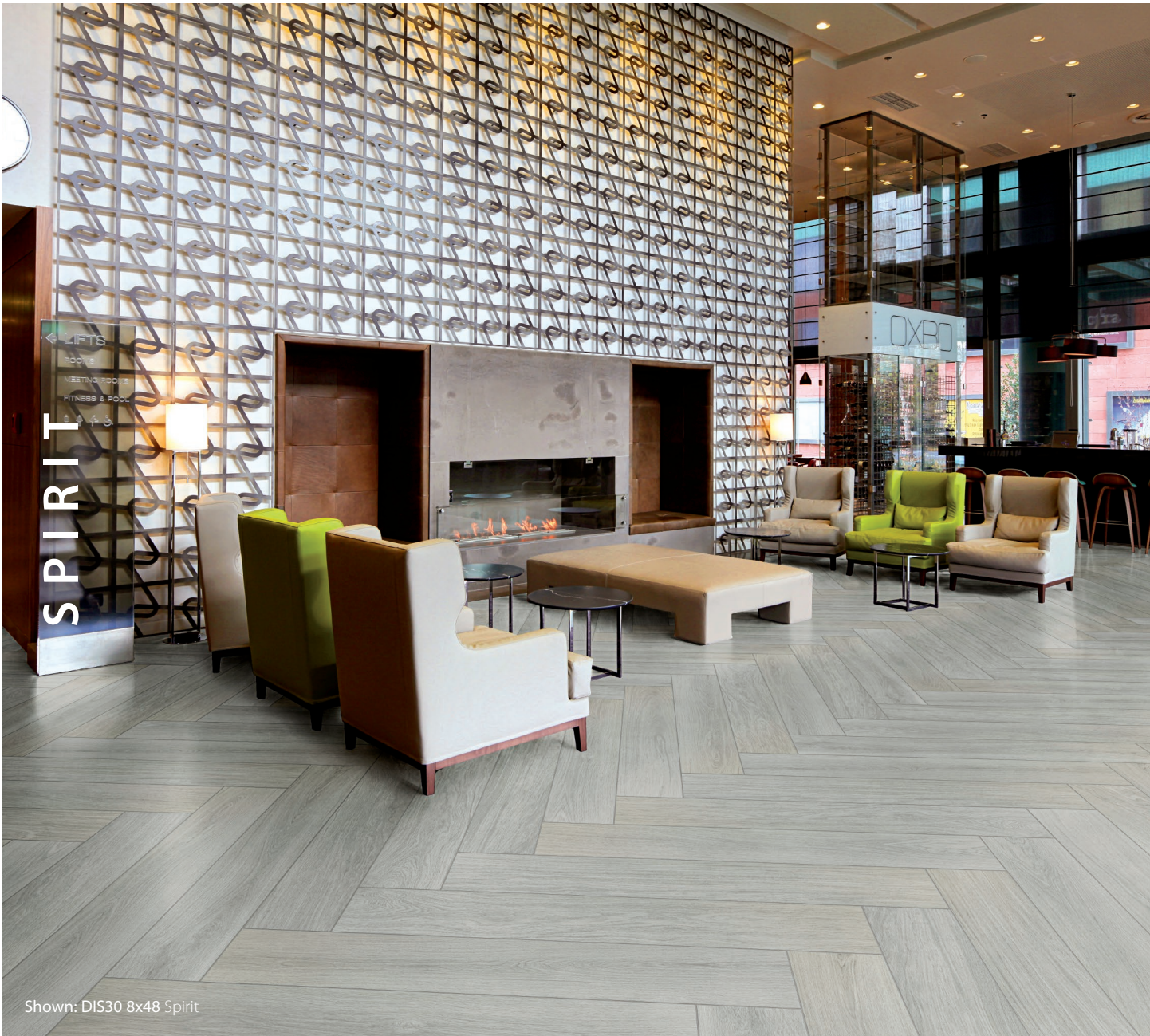
Shown: DIS30 8x48 Spirit