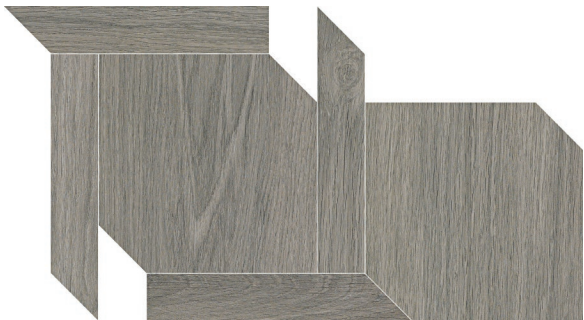
DIS20M10x13TWI Twist Barley mosaic