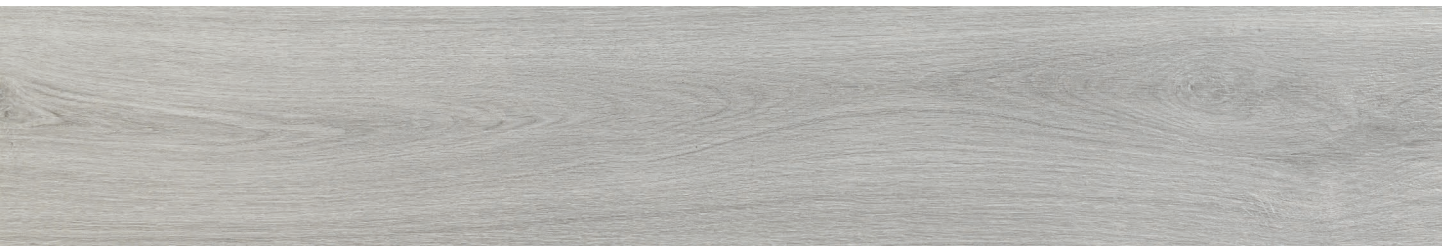
DIS30 8x48 Spirit