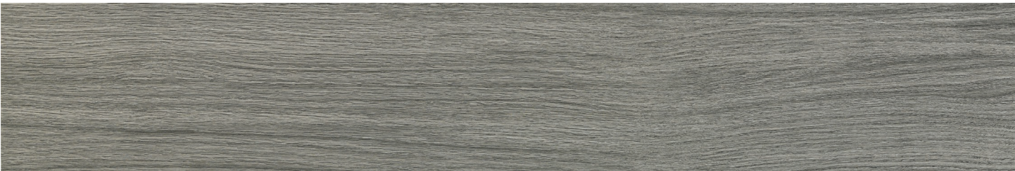
DIS40 8x48 Proof