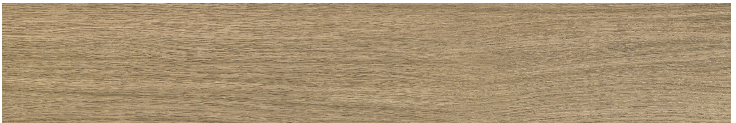
DIS10 8x48 Wheat