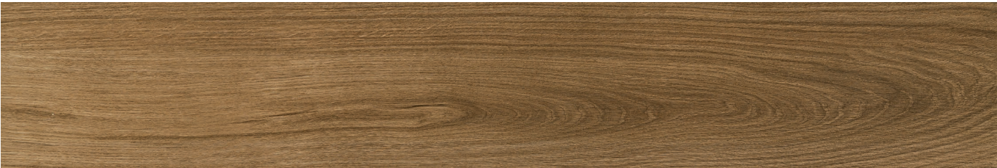
DIS50 8x48 Malt