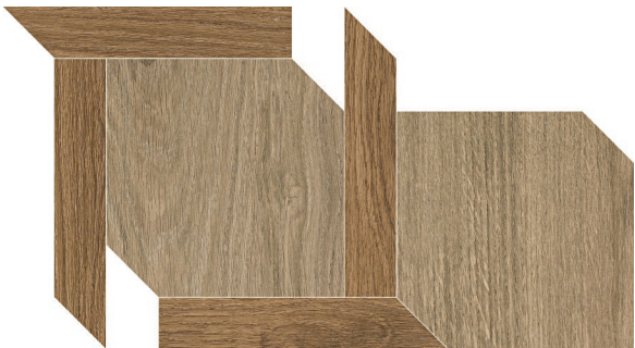
DIS65M10x13TWI Twist Warm Mix mosaic (Features Wheat & Malt)