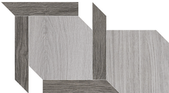
DIS75M10x13TWI Twist Cool Mix mosaic (Features Spirit & Proof)