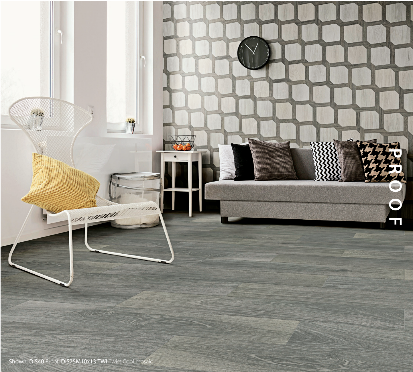
Shown: DIS40 Proof, DIS75M10x13 TWI Twist Cool mosaic