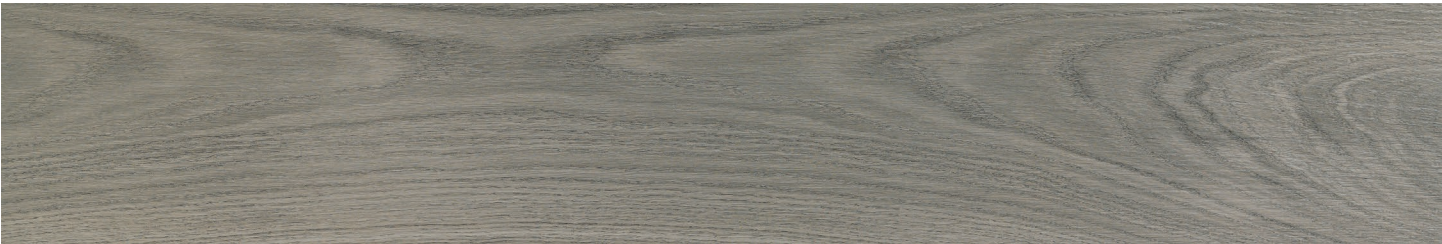
DIS20 8x48 Barley