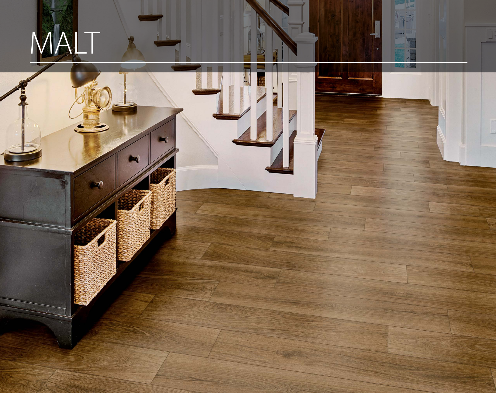
above: DIS50 8x48 Malt