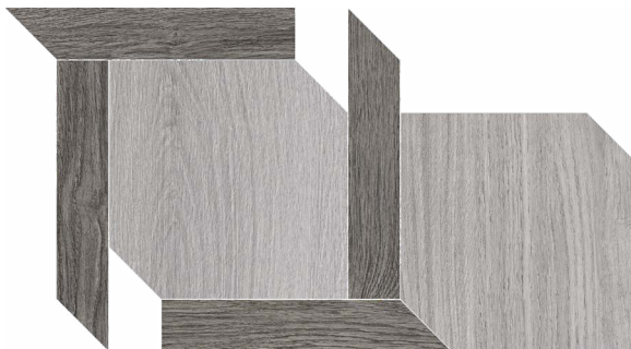
DIS75M10x13TWI Twist Cool Mix Mosaic (features Spirit & Proof)