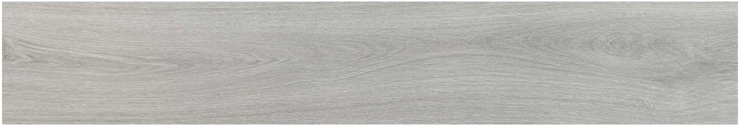
DIS30 8x48 Spirit