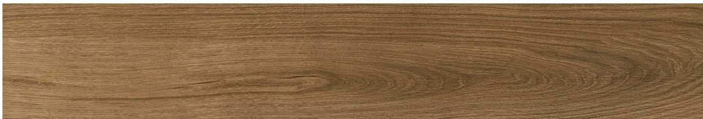
DIS50 8x48 Malt