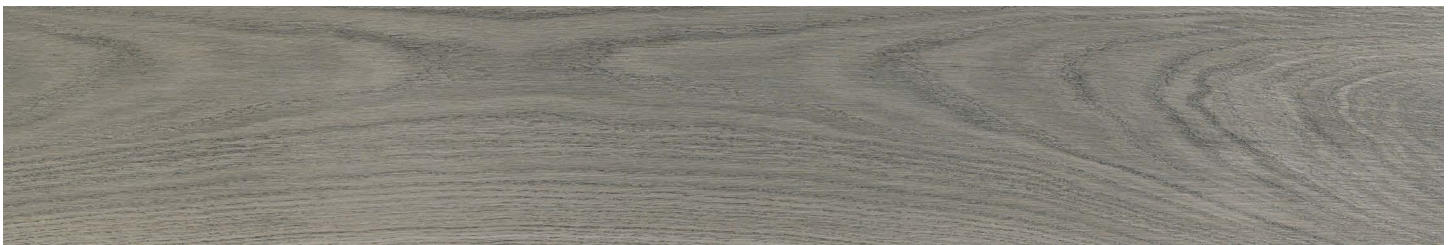
DIS20 8x48 Barley