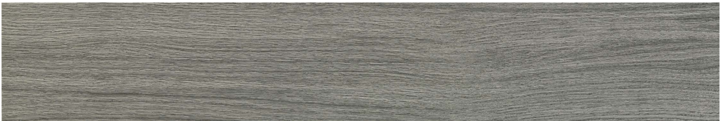
DIS40 8x48 Proof