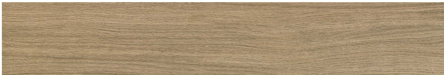
DIS10 8x48 Wheat