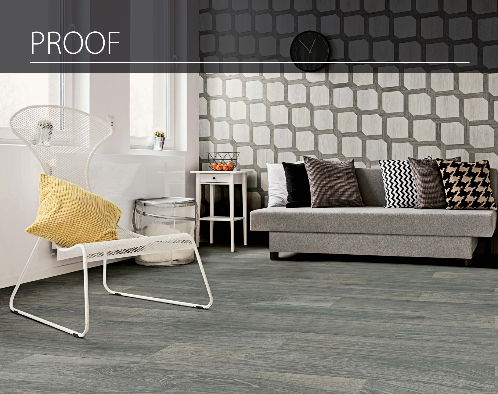
above: DIS40 8x48 Proof & DIS75M10x13TWI Twist Cool Mosaic