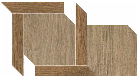
DIS65M10x13TWI Twist Warm Mix mosaic (features Wheat & Malt)