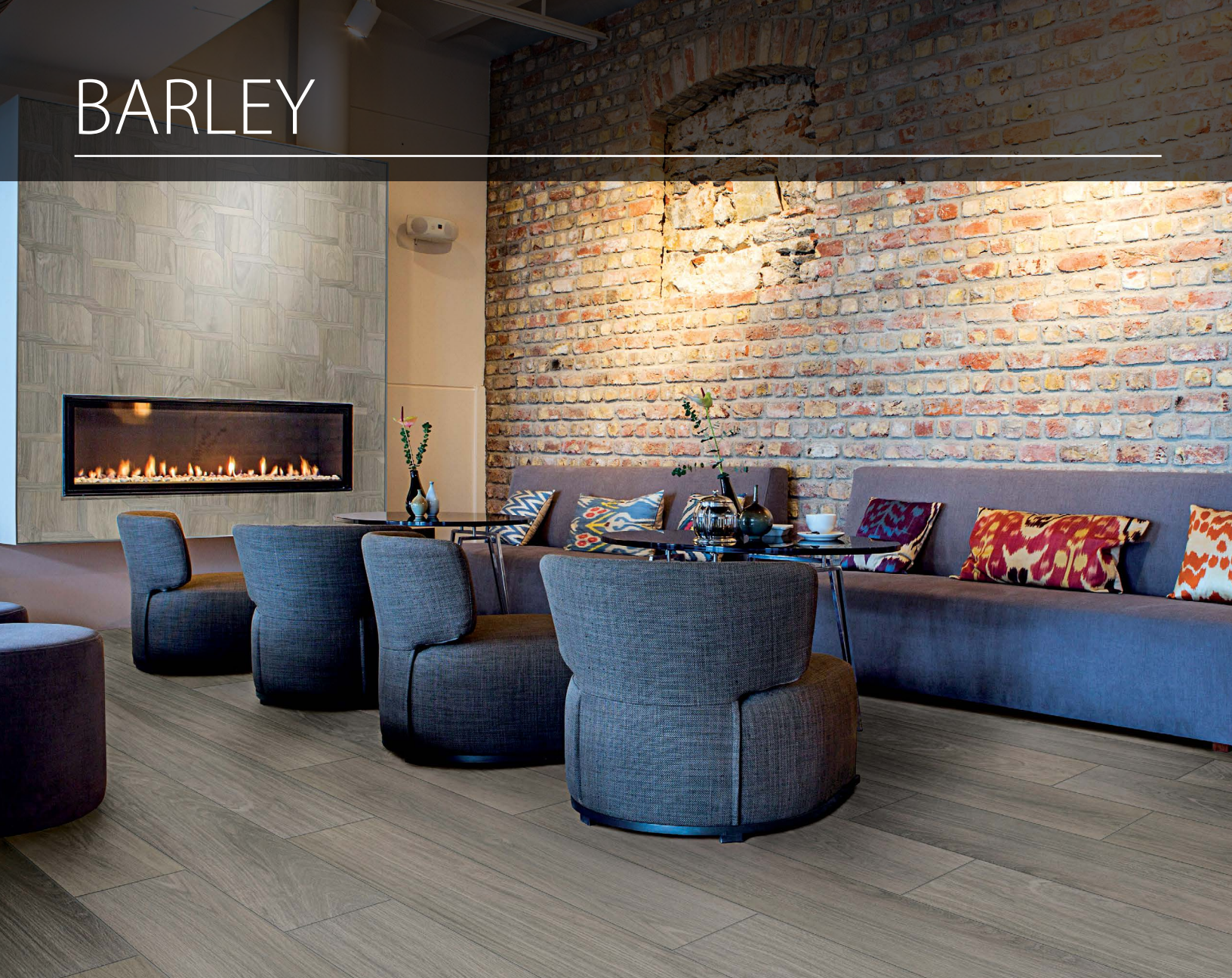
above: DIS20 8x48 Barley & DIS20M10x13TWI Twist Barley Mosaic