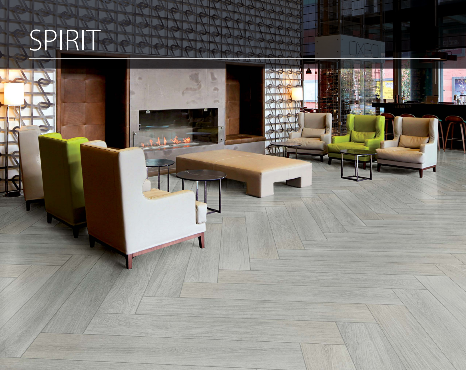
above: DIS30 8x48 Spirit