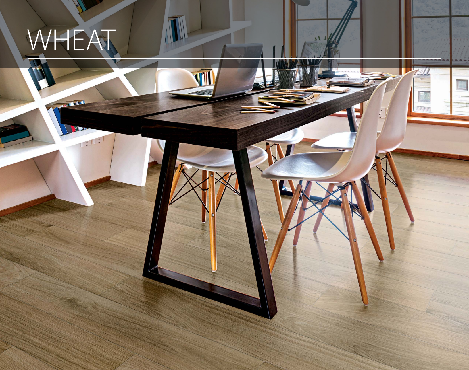
above: DIS10 8x48 Wheat