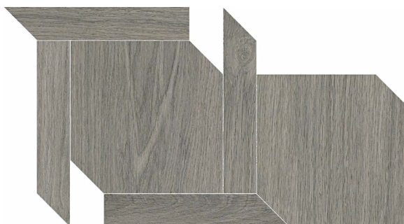
DIS20M10x13TWI Twist Barley mosaic