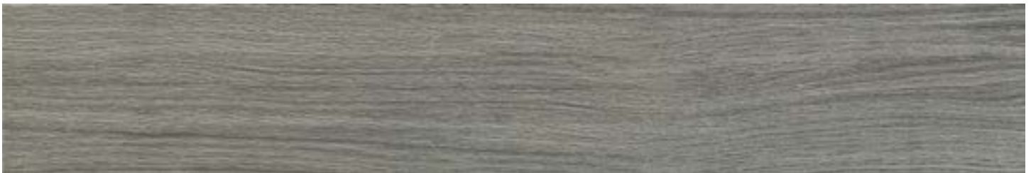
DIS40 8x48 Proof