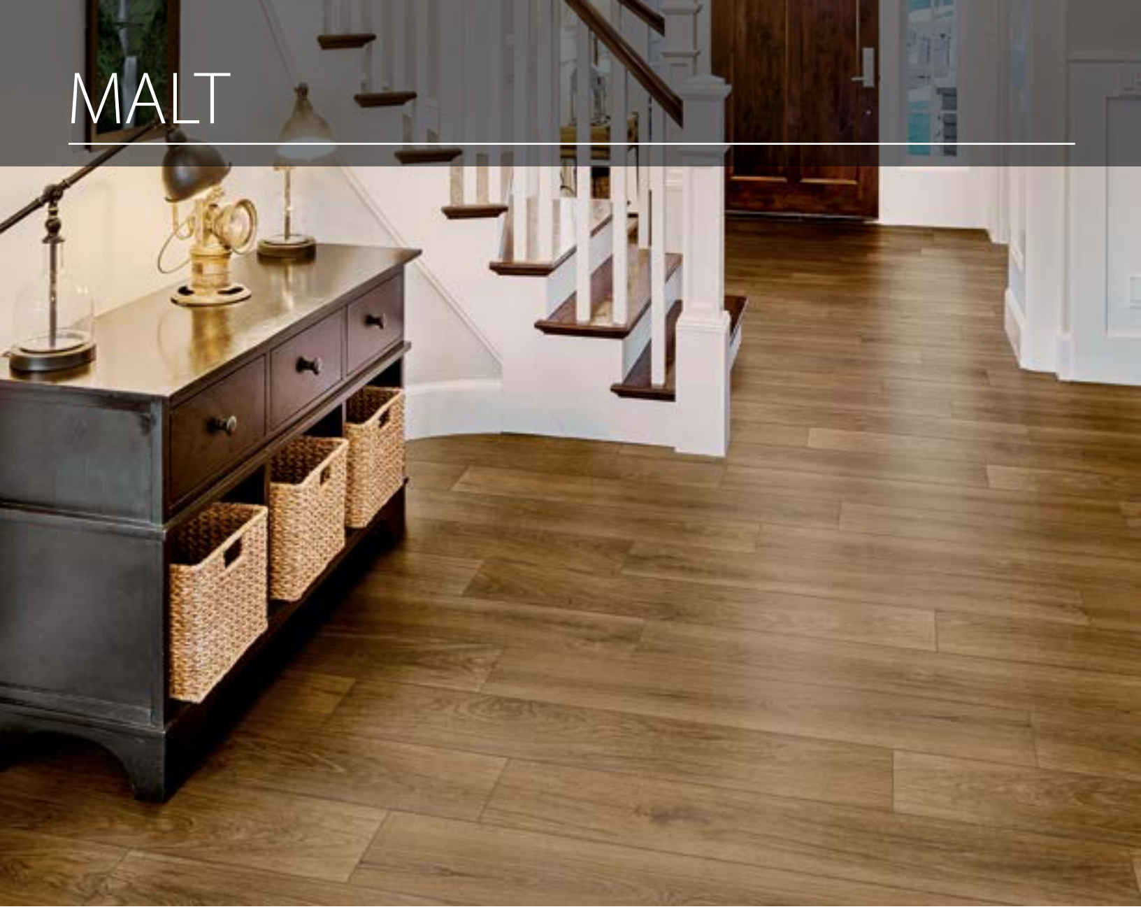
above: DIS50 8x48 Malt