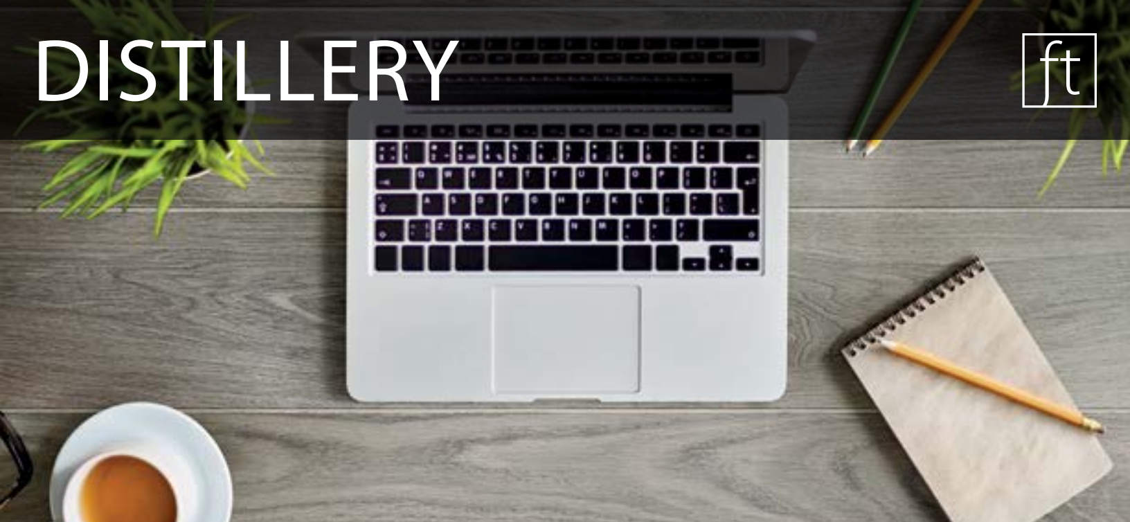
above: DIS20 8x48 Barley