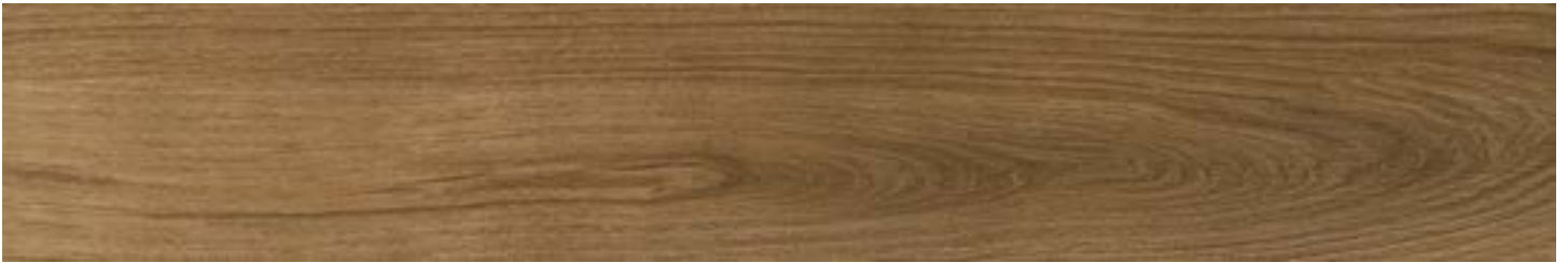
DIS50 8x48 Malt