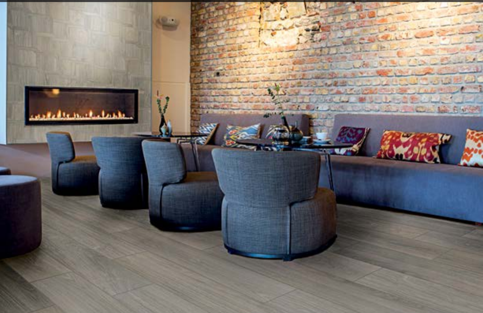
above: DIS20 8x48 Barley & DIS20M10x13TWI Twist Barley Mosaic