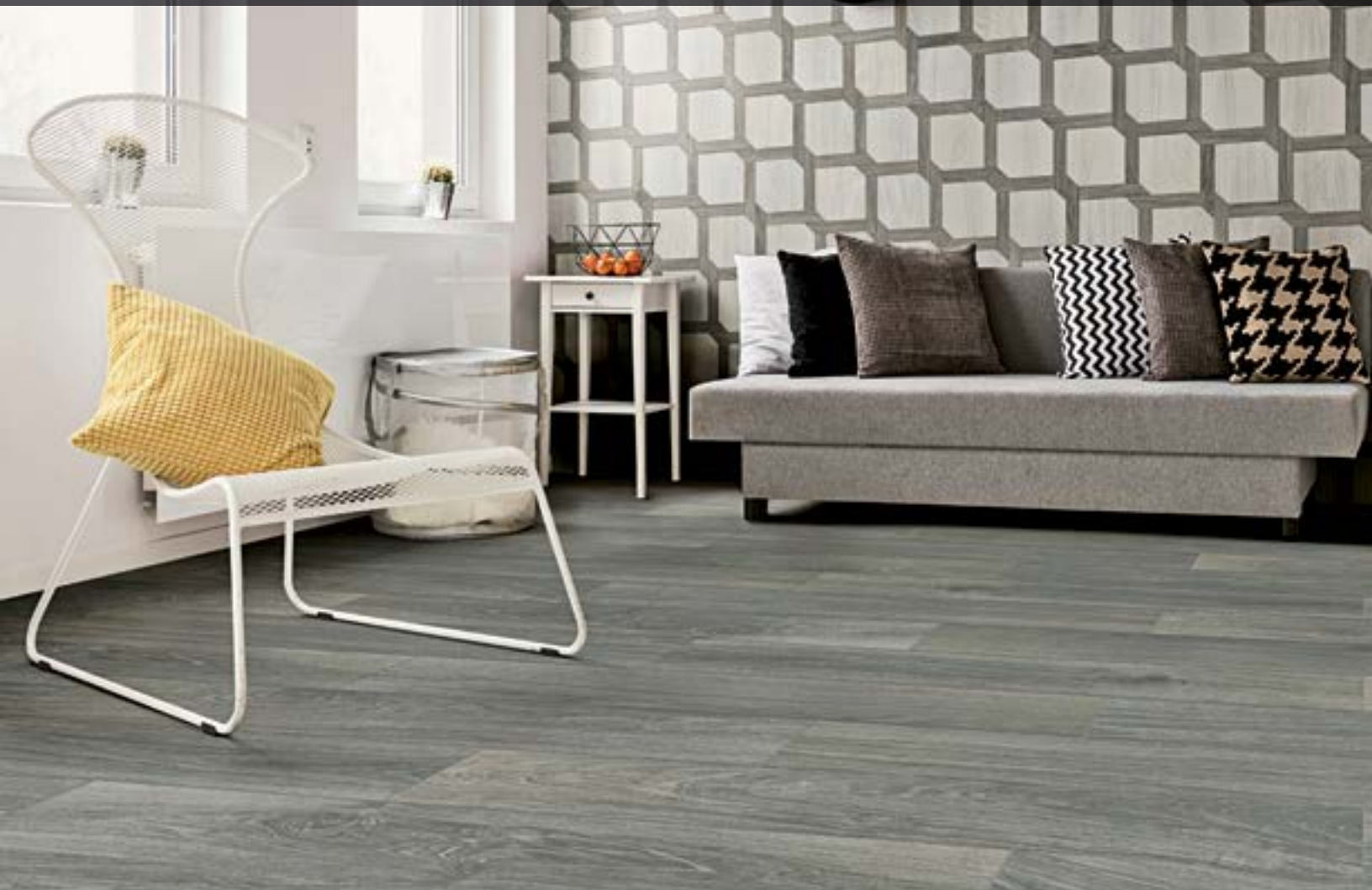
above: DIS40 8x48 Proof & DIS75M10x13TWI Twist Cool Mosaic