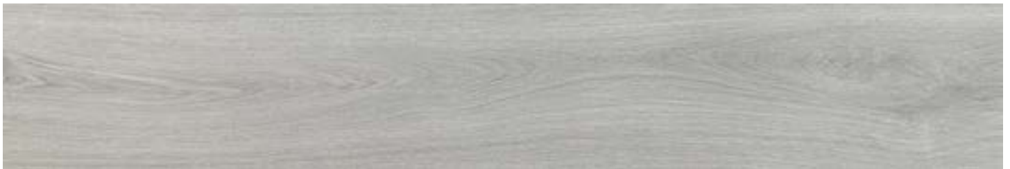
DIS30 8x48 Spirit