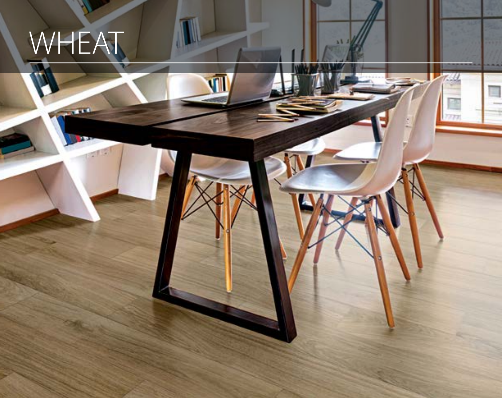
above: DIS10 8x48 Wheat