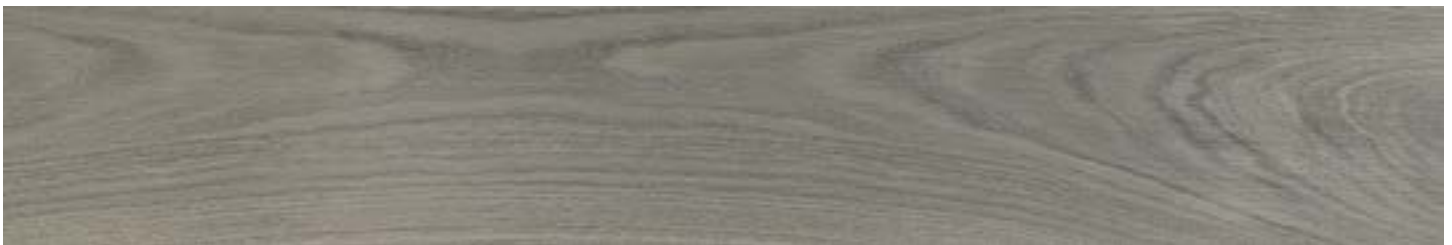
DIS20 8x48 Barley