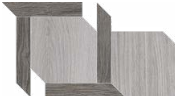
DIS75M10x13TWI Twist Cool Mix Mosaic (features Spirit & Proof)