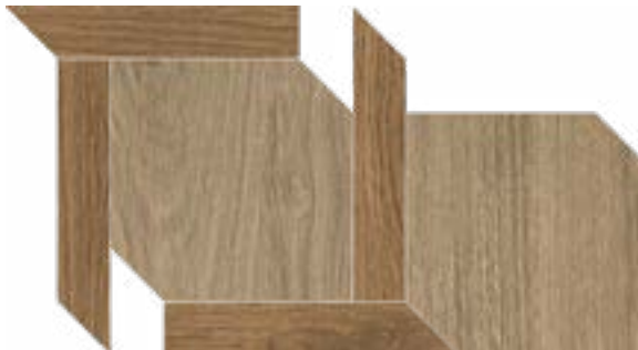
DIS65M10x13TWI Twist Warm Mix mosaic (features Wheat & Malt)