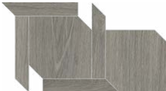
DIS20M10x13TWI Twist Barley mosaic