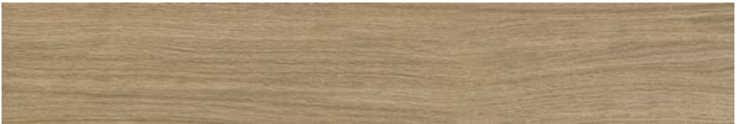
DIS10 8x48 Wheat