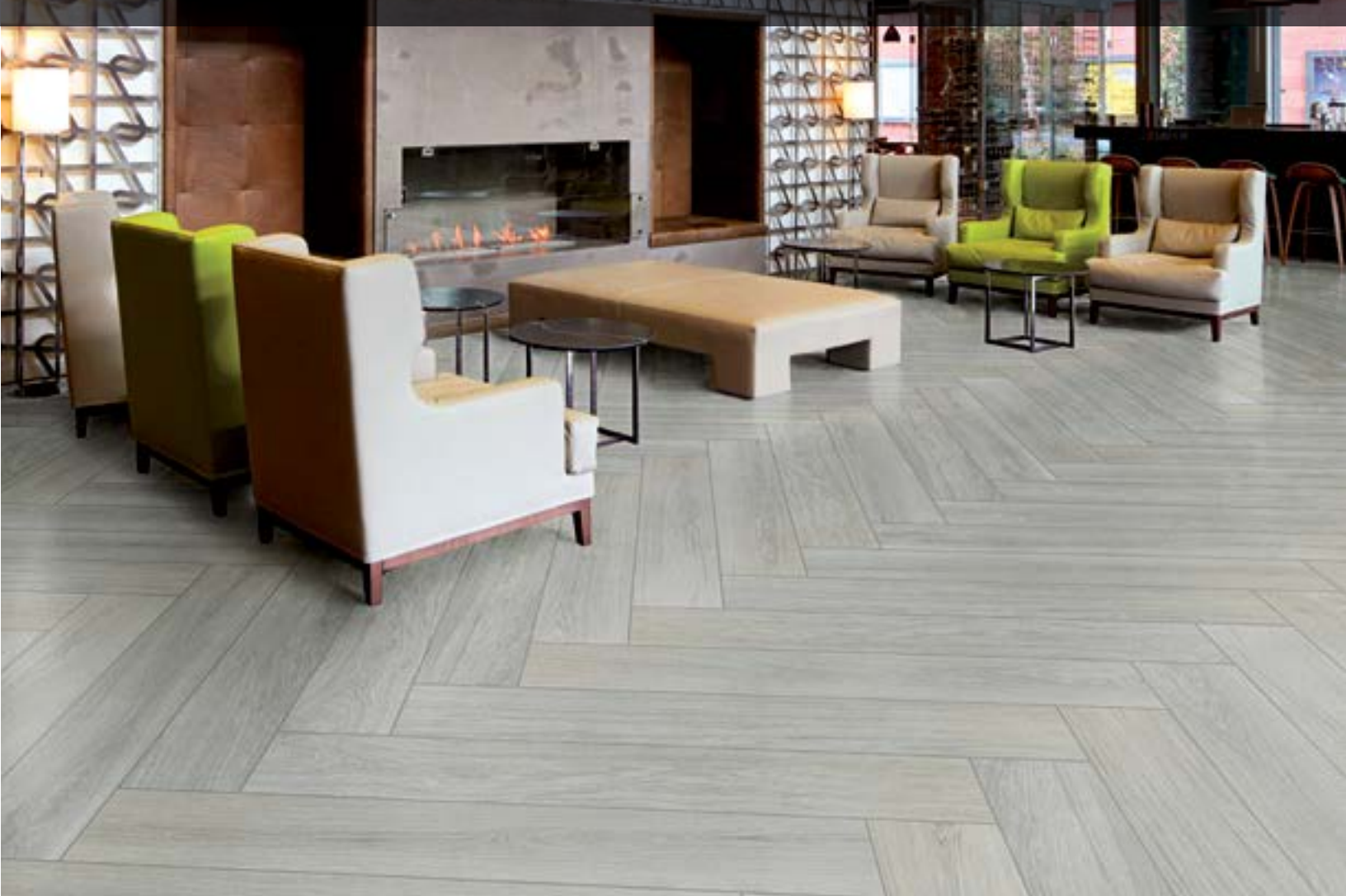
above: DIS30 8x48 Spirit