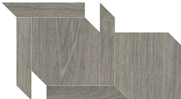
DIS20M10x13TWI Twist Barley mosaic