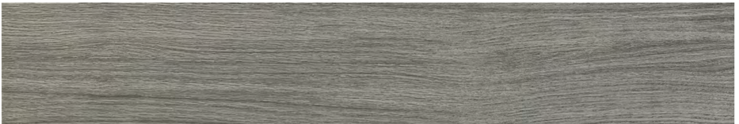
DIS40 8x48 Proof