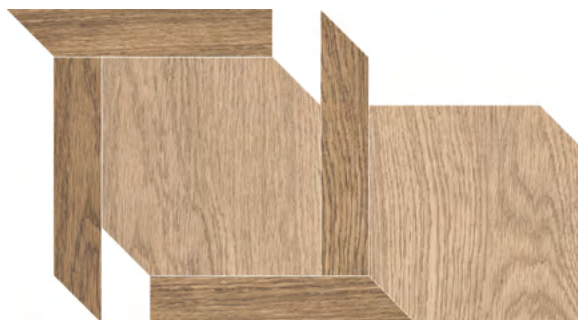
DIS65M10x13TWI Twist Warm Mix mosaic (Wheat & Malt)