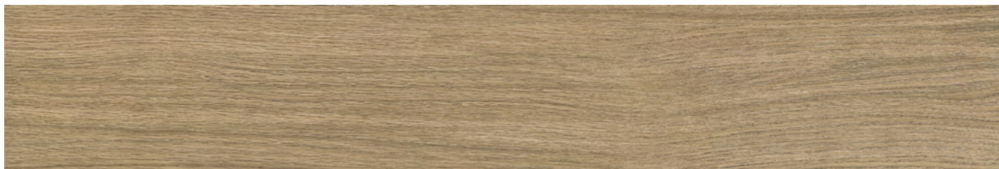
DIS10 8x48 Wheat