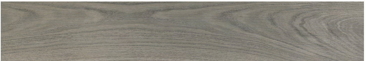
DIS20 8x48 Barley