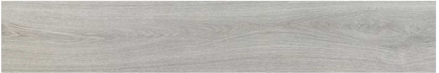
DIS30 8x48 Spirit