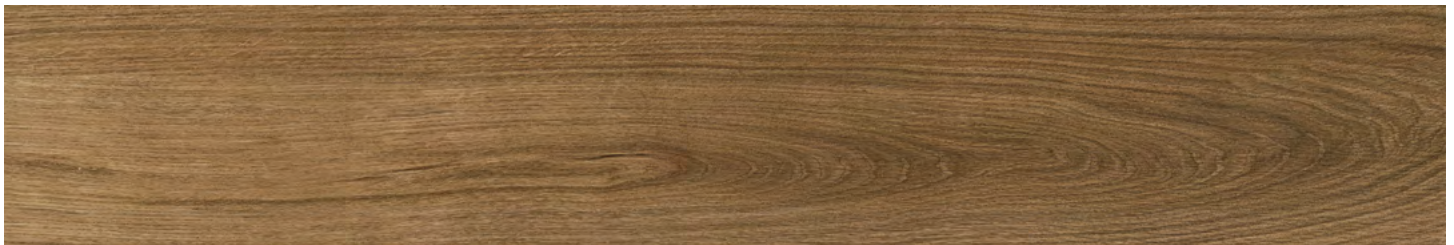
DIS50 8x48 Malt