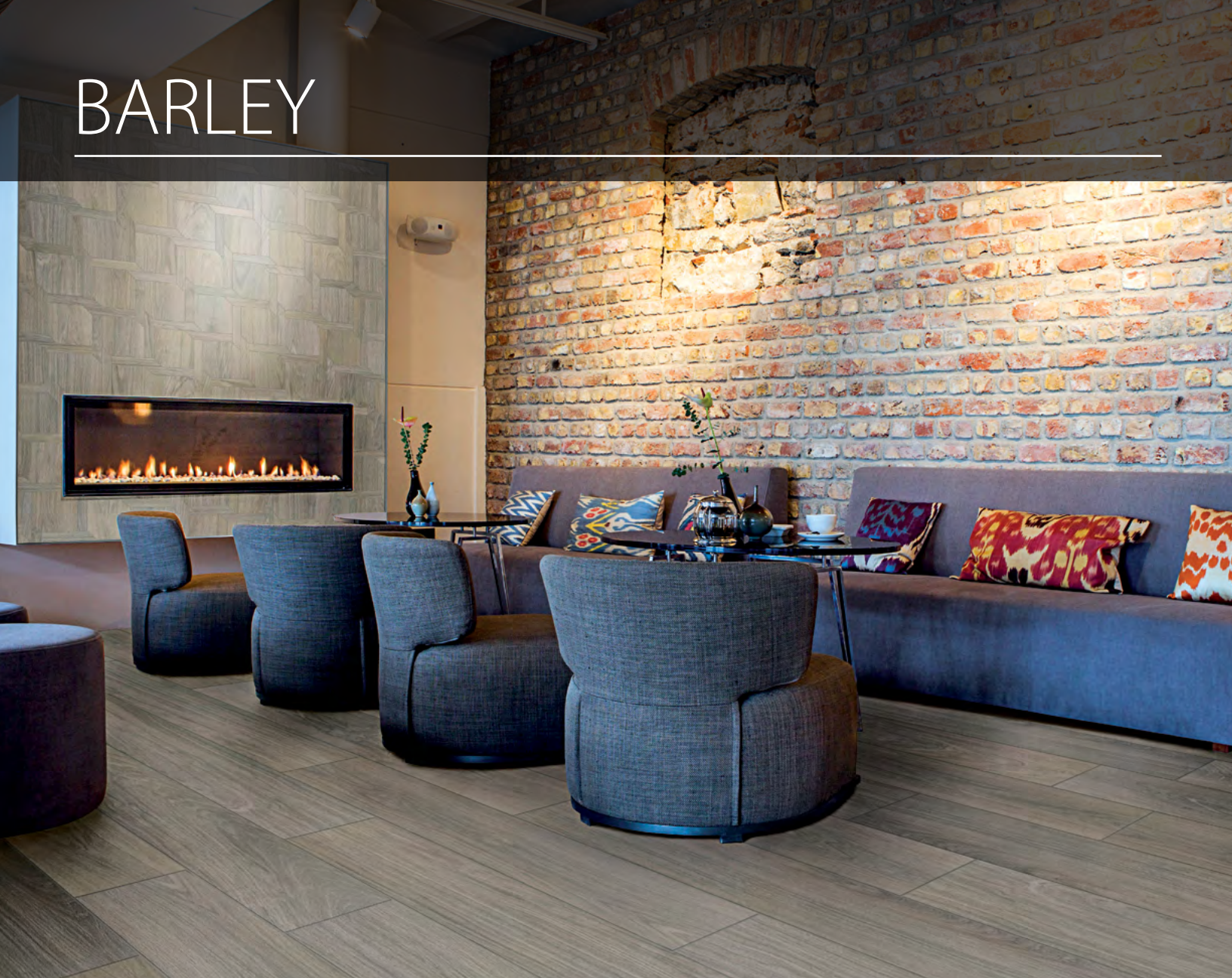
above: DIS20 8x48 Barley & DIS20M10x13TWI Twist Barley Mosaic