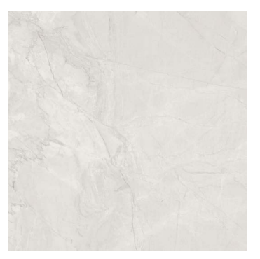
AIN40 12x12 Breccia Mist