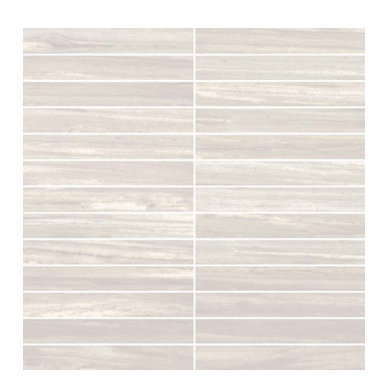
AIN30/M1x6STK Zebrino Taupe Stack