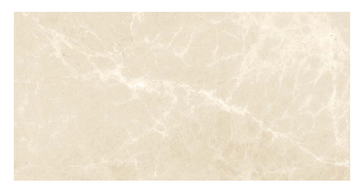
AIN2W 12.1x24.4 Emperador Beige (ceramic glossy wall)