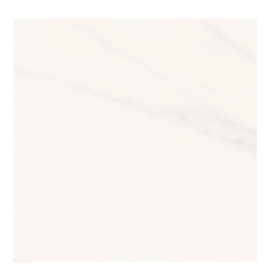
AIN10 12x12 Calacatta Gold