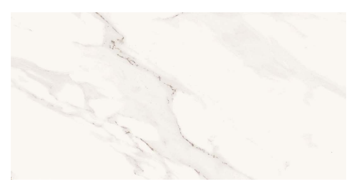
AIN1W 12.1x24.4 Calacatta Gold (ceramic glossy wall)