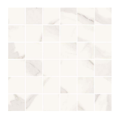
AIN10/M122 Calacatta Gold 36pc Mosaic