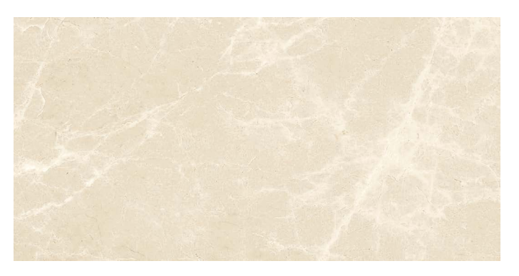
AIN20 12x24 Emperador Beige