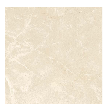
AIN20 12x12 Emperador Beige