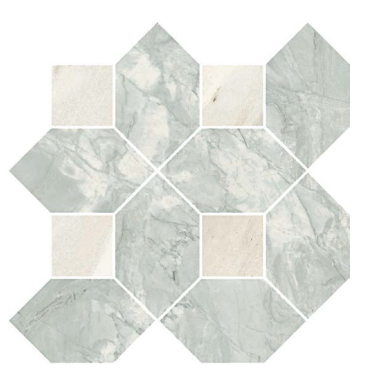
AIN55/M4x4HEX Hexagon Mix (Calacatta Gold & Breccia Mist)