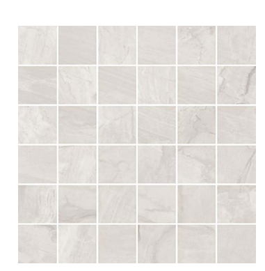
AIN40/M122 Breccia Mist 36pc Mosaic