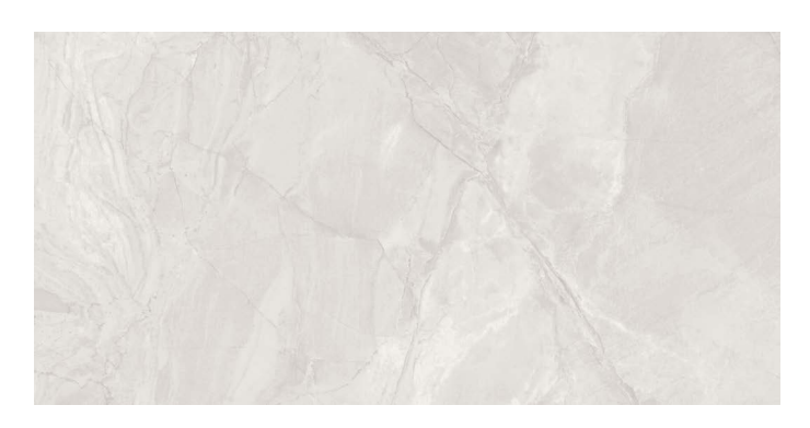
AIN4W 12.1x24.4 Breccia Mist (ceramic glossy wall)