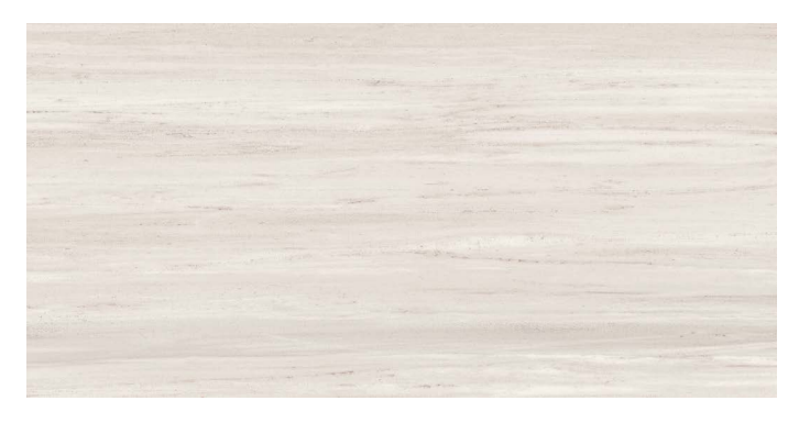
AIN3W 12.1x24.4 Zebrino Taupe (ceramic glossy wall)