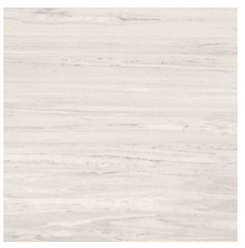
AIN30 12x12 Zebrino Taupe