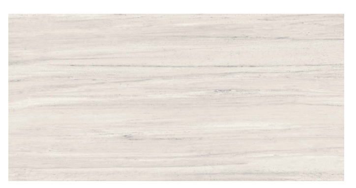
AIN30 12x24 Zebrino Taupe