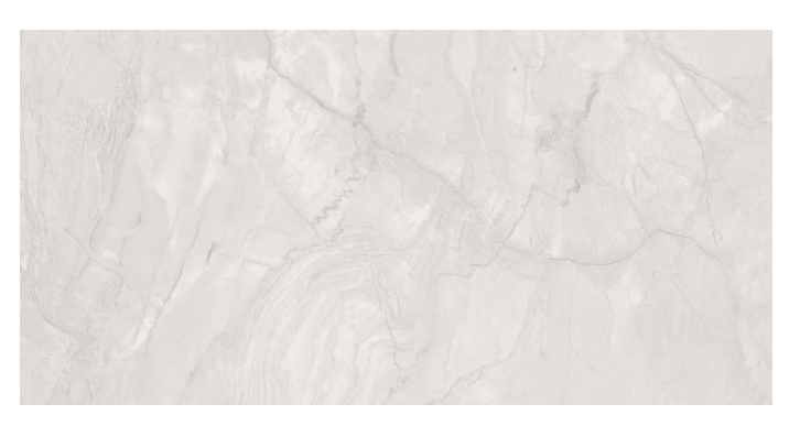
AIN40 12x24 Breccia Mist