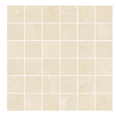
AIN20/M122 Emperador Beige 36pc Mosaic