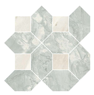
AIN55/M4x4HEX Hexagon Mix (Calacatta Gold & Breccia Mist)