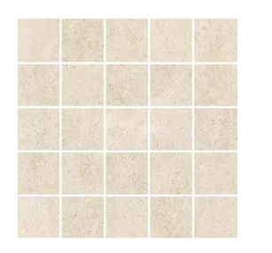
LRV10/M12 Cascade Beige 25pc Mosaic (available in all colors)