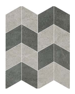
LRV24/M3x3CHEV Cool Mix Chevron Mosaic (Rush Gray & Torrent Black)