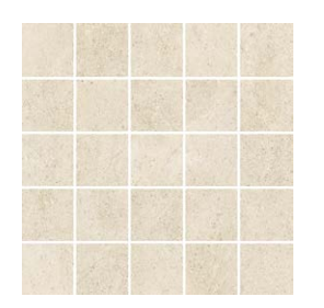
LRV10/M12 Cascade Beige 25pc Mosaic