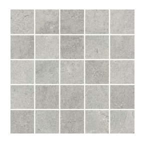
LRV20/M12 Rush Gray 25pc Mosaic