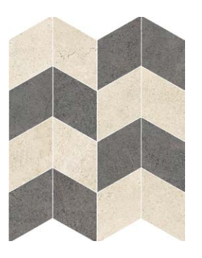
LRV13/M3x3CHEV Warm Mix Chevron Mosaic (Cascade Beige & Adrift Taupe)