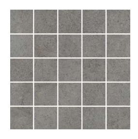
LRV30/M12 Adrift Taupe 25pc Mosaic