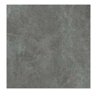
LRV40 Torrent Black