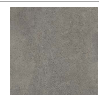
LRV30 Adrift Taupe