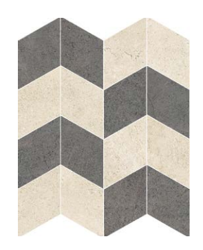
LRV13/M3x3CHEV Warm Mix Chevron Mosaic (Cascade Beige & Adrift Taupe)