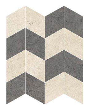
LRV13/M3x3CHEV Warm Mix Chevron Mosaic (Cascade Beige & Adrift Taupe)