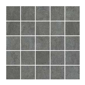
LRV40/M12 Torrent Black 25pc Mosaic