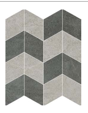
LRV24/M3x3CHEV Cool Mix Chevron Mosaic (Rush Gray & Torrent Black)