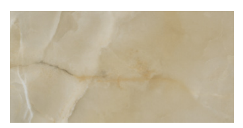
ALU30 12x24 ALU30P 12x24 Polished (not shown)