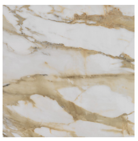
ALU20 24x24 ALU20P 24x24 Polished (not shown)