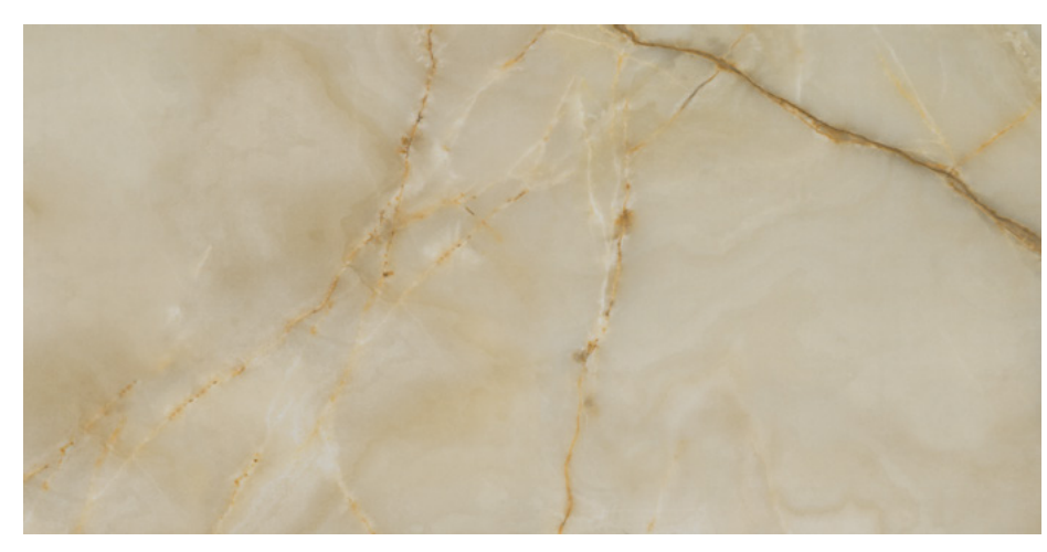
ALU30 24x48 ALU30P 24x48 Polished (not shown)

ALU30P/L3/4x24 Inlay Wall Liner Gold (polished only)