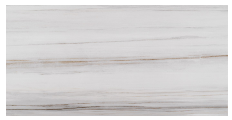
ALU10 24x48 ALU10P 24x48 Polished (not shown)

ALU10P/L3/4x24 Inlay Wall Liner Silver (polished only)