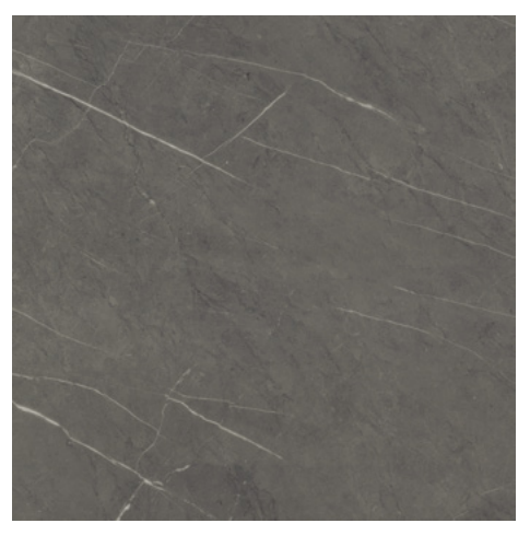
ALU40 24x24 ALU40P 24x24 Polished (not shown)