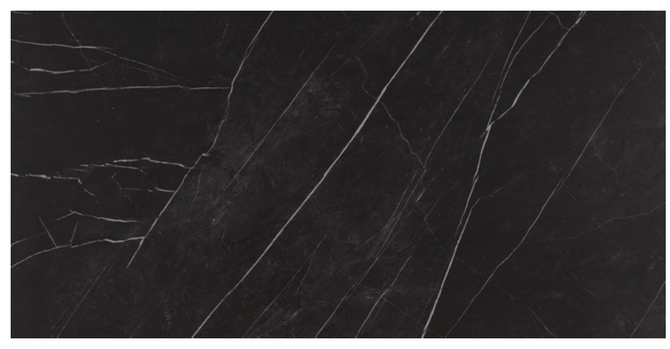
ALU50 24x48 ALU50P 24x48 Polished (not shown)