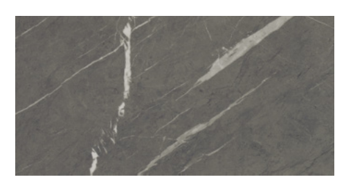
ALU40 12x24 ALU40P 12x24 Polished (not shown)