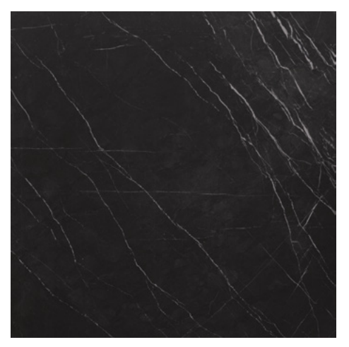
ALU50 24x24 ALU50P 24x24 Polished (not shown)