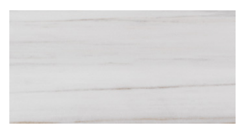
ALU10 12x24 ALU10P 12x24 Polished (not shown)