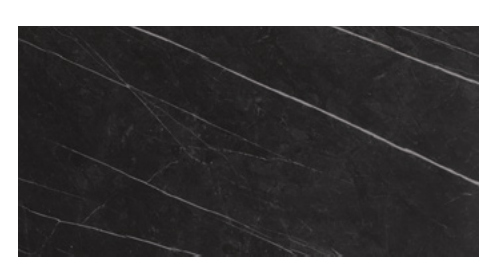
ALU50 12x24 ALU50P 12x24 Polished (not shown)