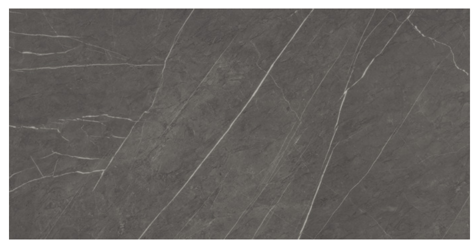
ALU40 24x48 ALU40P 24x48 Polished (not shown)