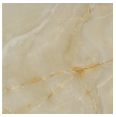
ALU30 24x24 ALU30P 24x24 Polished (not shown)