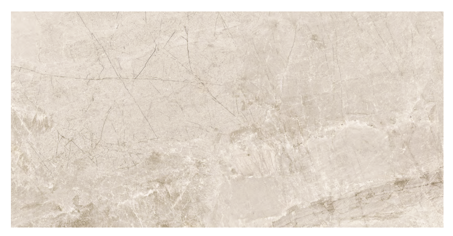
TMP20 24x48 Nature Beige TMP20P 24x48 Nature Beige (polished)