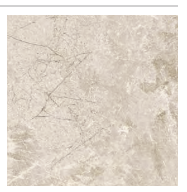
ASH COOL GRAY