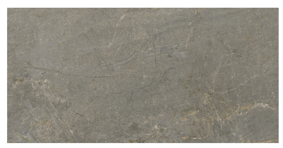
TMP40 24x48 Dark Gray TMP40P 24x48 Dark Gray (polished)