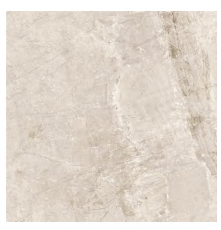
TMP20 24x24 Nature Beige TMP20P 24x24 Nature Beige (polished)