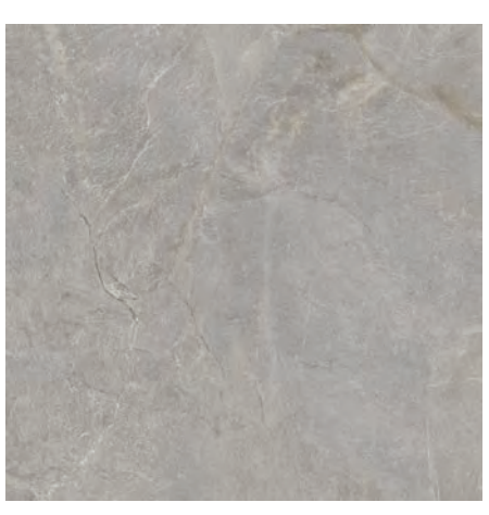
TMP30 24x24 Ash Cool Gray TMP30P 24x24 Ash Cool Gray (polished)