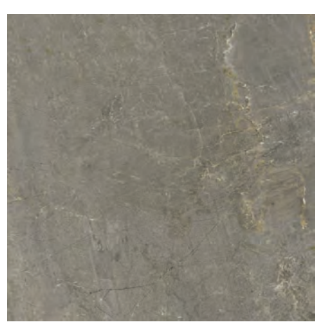
TMP40 24x24 Dark Gray TMP40P 24x24 Dark Gray (polished)