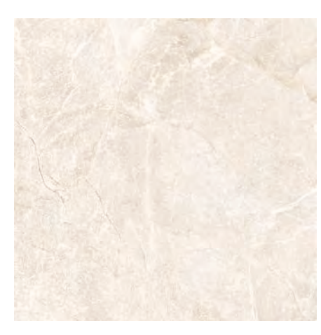
TMP10 24x24 Cotton White TMP10P 24x24 Cotton White (polished)