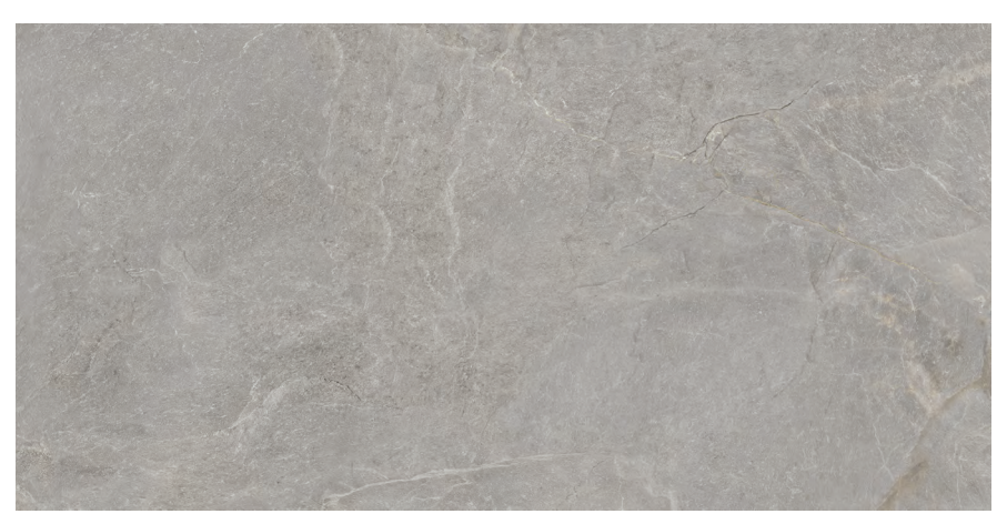
TMP30 24x48 Ash Cool Gray TMP30P 24x48 Ash Cool Gray (polished)