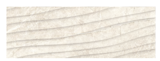
TMP20PC 12x35 Nature Beige (glossy ceramic curve)