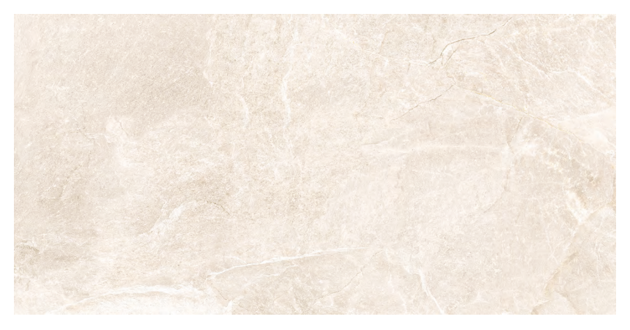
TMP10 24x48 Cotton White TMP10P 24x48 Cotton White (polished)