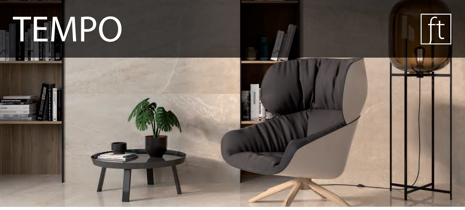
above: TMP40P 24x48 Dark Gray (polished), TMP20 24x48 Nature Beige & TMP20P 24x48 Nature Beige (polished)