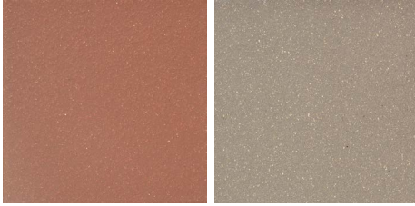
77310 Mayflower Red 77507 Puritan Gray