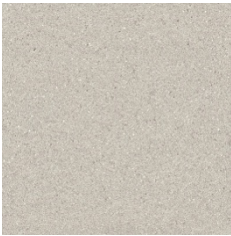
Grey Floor/Wall (Porcelain)