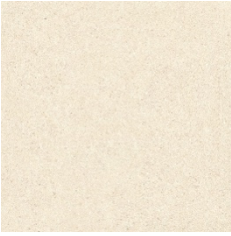
White Floor/Wall (Porcelain)